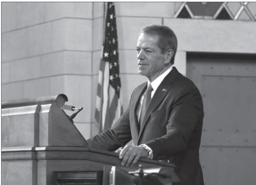
Gov. Jim Pillen addresses lawmakers Jan. 15.

“I look forward to working alongside you ... to do the work of our state this session,” he said. ■