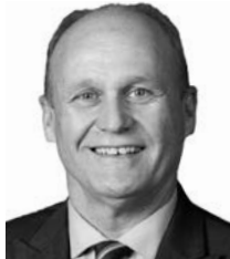
Sen. Dan Quick

LB60, sponsored by Grand Island Sen. Dan Quick, would remove a current prohibition in state law on the sale of lottery tickets through vending or dispensing devices. Calling the measure a “very modest and logical update,” Quick said that of the 45 states that conduct lotteries, only Nebraska and South Carolina currently do not allow vending machine sales.