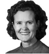
District 24, Seward Sen. Jana Hughes

Office: Room 1124, State Capitol Lincoln, NE 68509 (402) 471-2719 jstorm@leg.ne.gov