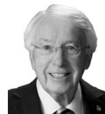
District 12, Ralston Sen. Merv Riepe

Office: Room 1212, State Capitol Lincoln, NE 68509 (402) 471-2612 tmckinney@leg.ne.gov