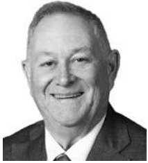
District 1, Syracuse Sen. Bob Hallstrom

Office: Room 1404, State Capitol Lincoln, NE 68509 (402) 471-2733 bhallstrom@leg.ne.gov