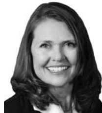
District 31, Omaha Sen. Kathleen Kauth

Office: Room 1208 State Capitol Lincoln, NE 68509 (402) 471-2620 mdorn@leg.ne.gov