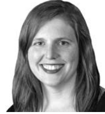
District 6, Omaha Sen. Machaela Cavanaugh

Office: Room 1528, State Capitol Lincoln, NE 68509 (402) 471-2710 mjuarez@leg.ne.gov