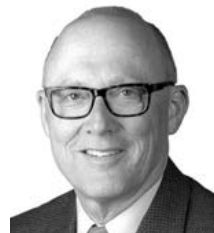
District 14, La Vista Sen. John Arch

Office: Room 1120, State Capitol Lincoln, NE 68509 (402) 471-2727 aspivey@leg.ne.gov