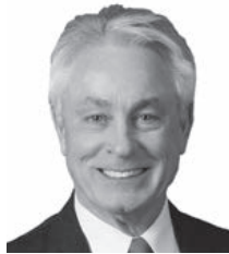
Sen. Loren Lippincott

Lippincott brought two proposals to alter the existing cloture rule. One option would retain the current two-thirds majority requirement, but would exclude members who are present but not voting. It also would