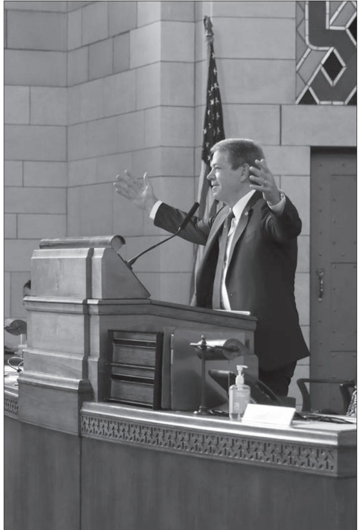
During his address, Gov. Jim Pillen urged lawmakers to embrace his policy agenda.

The governor also prioritized eliminating the current