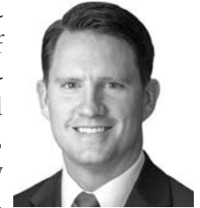
Sen. Ben Hansen

The committee took no immediate action on any of the proposed rule changes. Debate on any changes forwarded to the floor by the committee is expected to begin Jan. 22. ■