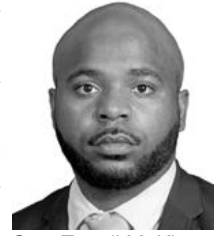
Sen. Terrell McKinney