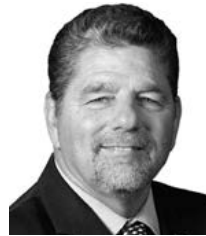
Sen. Dan Lonowski