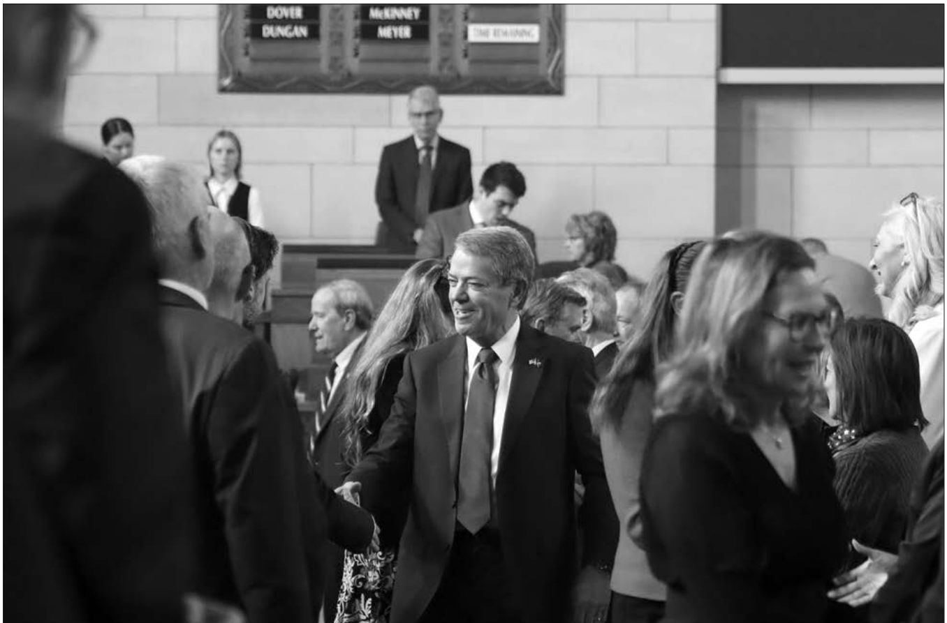
Gov. Jim Pillen greets senators as he is escorted from the George W. Norris Legislative Chamber after delivering his State of the State address Jan. 15.

PRESRT STD U.S. POSTAGE PAID LINCOLN, NE PERMIT NO. 212