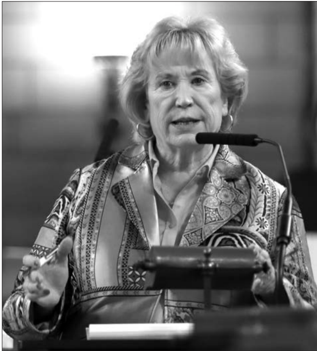
Sen. Lou Ann Linehan, chairperson of the Revenue Committee

A mong the proposals advanced by the Revenue Committee this session is a package of bills that cut individual and corporate income tax rates, speed up the phaseout of state taxation of Social Security income and expand a program intended to offset property taxes used to fund education.