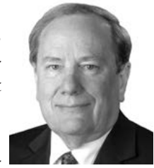
Sen. Mike Moser

LB984, introduced by Columbus Sen. Mike Moser and passed 45-0, increases the fee to 3 percent of the first $5,000 remitted each month, or $150, beginning Oct. 1, 2022.