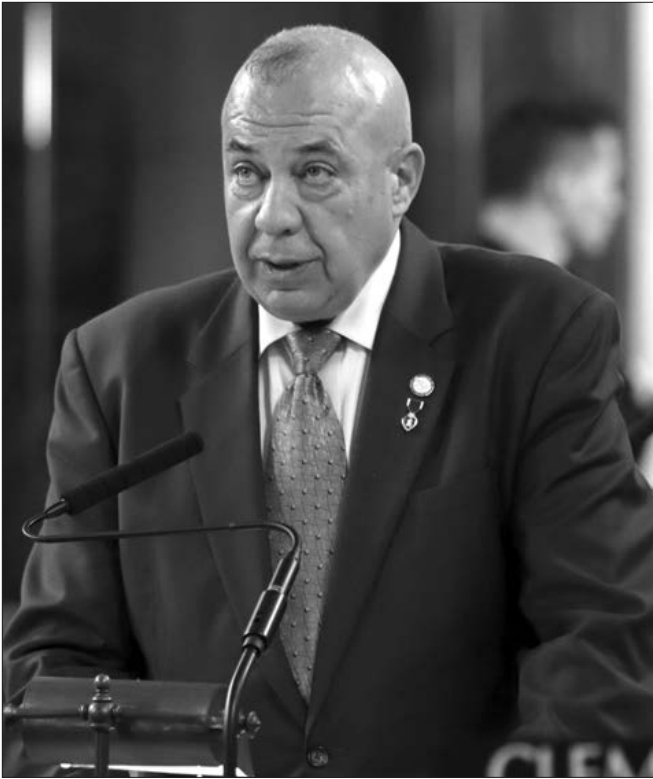
Sen. Tom Brewer, chairperson of the Government, Military and Veterans Affairs Committee

E lection law updates, an evaluation of state procurement practices and Nebraska's participation in a convention of the states were addressed this session by the Government, Military and Veterans Affairs Committee.