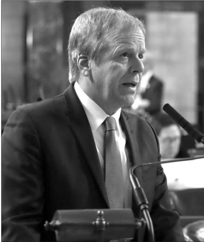
Sen. Tom Briese, chairperson of the General Affairs Committee

Casino gaming regulations and the distribution rights of craft breweries topped the list of issues considered by the General Affairs Committee this session.