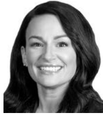
Sen. Jen Day

Under LB310, any interest in property passing to ben-