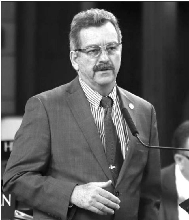
Sen. Bruce Bostelman, chairperson of the Natural Resources Committee

The Natural Resources committee advanced bills this session authorizing construction of a South Platte River canal and several water recreation and tourism projects across the state, including a proposed lake between Omaha and Lincoln.