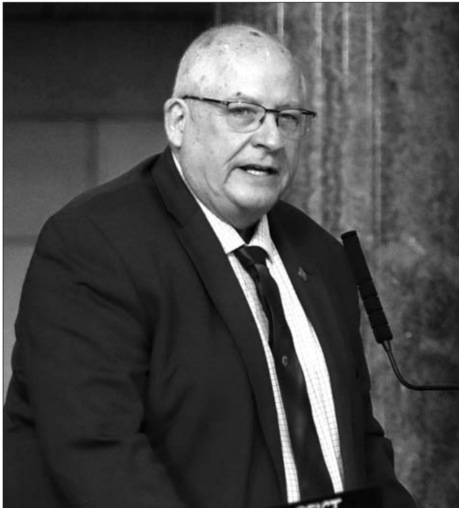
Sen. Curt Friesen, chairperson of the Transportation and Telecommunications Committee

Lawmakers approved measures this session to expand broadband access throughout the state, provide for public-private partnerships and change laws regarding the state Department of Motor Vehicles.