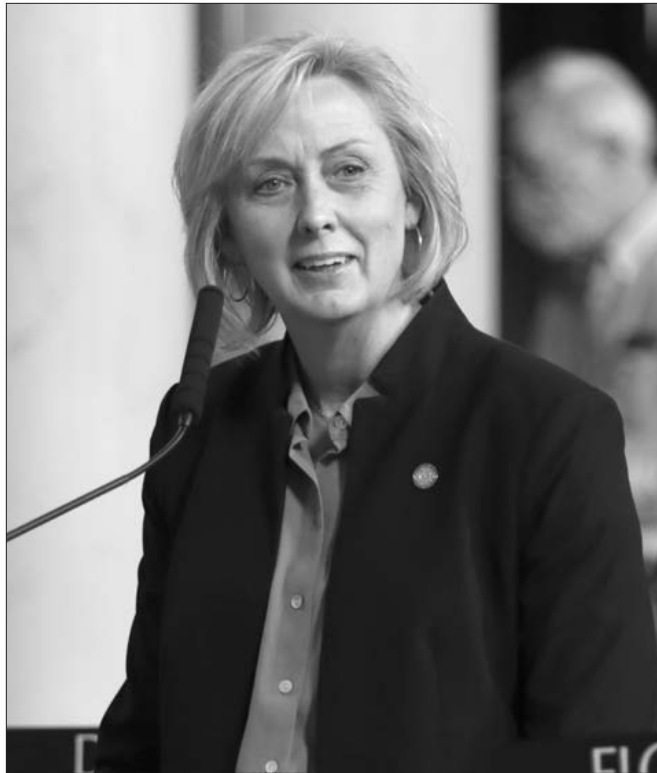
Sen. Lynne Walz, chairperson of the Education Committee

Measures intended to attract and retain teachers, improve student access to mental and behavioral health services and prepare students for technology-related jobs were among those advanced by the Education Committee this session.