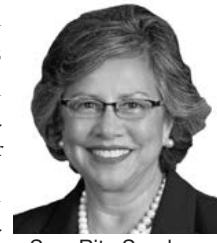
Sen. Rita Sanders

Sanders, a policy would have included how the district would provide parents and guardians access to digital and learning materials and training materials for teachers, administrators and staff as well as procedures for the review and approval of such materials and activities, among other information.