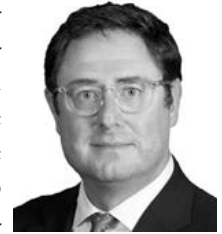
Sen. Michael Flood

LB800 passed on a 48-0 vote and took effect immediately.