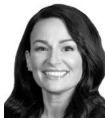
Sen. Jen Day