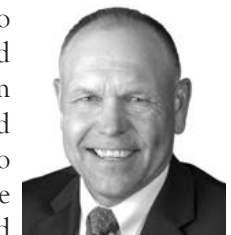
Sen. Tom Brandt

Owners of modern farm machinery would have had the same access as authorized dealers to the software, tools, technical manuals and parts needed to make repairs under LB543, introduced last session by Plymouth Sen. Tom Brandt. The bill would have required original equipment manufacturers to make available, on fair and reasonable terms, the documentation, parts and tools needed to diagnose, maintain or repair electronics-enabled agricultural equipment to independent mechanics or the equipment's owner.