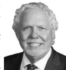
Sen. Rich Pahls

This includes any parking lot, garage or other parking structure that is located within 600 yards of a convention and meeting center facility but is not directly connected to it.