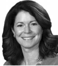
Sen. Suzanne Geist

Also included are provisions of LB72, introduced by Sen. Suzanne Geist of Lincoln, which allow the holder of a Class C, I or Y liquor license to sell alcohol not in the original package — such as a mixed drink, cocktail or wine slushy — for consumption off the premises.