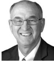
Sen. Myron Dorn

LB103, sponsored by Sen. Myron Dorn of Adams, appropriates $2 million in general funds in FY2021-22 and FY2022-23 to any county that has a judgment against it from a federal court of more than $25 million if the total cost of the judgment exceeds 20 percent of the county's annual budget.