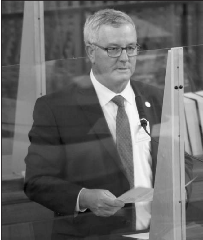
Sen. Dan Hughes, chairperson of the Executive Board

The Executive Board advanced measures this session that established legislative committees to investigate a child welfare contract and provide oversight to the state's youth rehabilitation and treatment centers, as well as a task force to study implementation of a mental health crisis line.