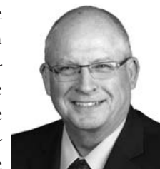
Sen. Curt Friesen

LB454 failed to advance to select file on a vote of 23-12. Twenty-five votes were needed.