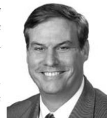
Sen. Mike McDonnell

LB406, sponsored by Omaha Sen. Mike McDonnell, creates a special committee, consisting of at least seven members of the Legislature, that will study the need to protect public and private property, enhance economic development and promote private investment along the Platte River and its tributaries from Columbus to Plattsmouth.