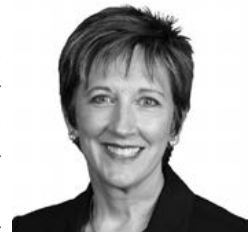
Sen. Patty Pansing Brooks

LB247, sponsored by Lincoln Sen. Patty Pansing Brooks, establishes the Mental Health Crisis Hotline Task Force to create an implementation plan for the 988 crisis hotline established by the federal government in 2020.