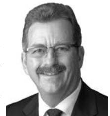
Sen. Bruce Bostelman

The bill requires any recipient of ongoing high-cost financial support from the state universal service fund to submit to broadband service speed tests by the PSC. Any universal service funds distributed for new broadband infrastructure construction will be directed to projects that provide service scalable to 100 Mbps or greater of upload speed.