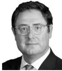
Sen. Michael Flood

Under LB650, introduced by Sen. Michael Flood of Norfolk and passed on a vote of 48-1, the Nebraska Oil and Gas Conservation Commission will regulate facilities that inject carbon dioxide through wells into underground geologic formations for permanent or