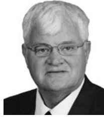
Sen. Mike Groene

Under LB40, introduced by Sen. Mike Groene of North Platte, a nonprofit economic development corporation may apply to the director of the state Department of Economic Development for up to $30 million in matching funds to cover a project's development costs. The director could approve up to $50 million in matching funds under the act.