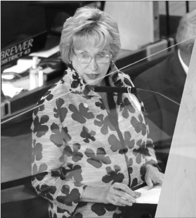
Sen. Lou Ann Linehan, chairperson of the Revenue Committee

The Revenue Committee advanced bills this session that cut Nebraska's top corporate income tax rate and will exempt military retirement pay and a percentage of Social Security income from state income tax.