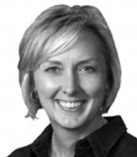
Sen. Lynne Walz