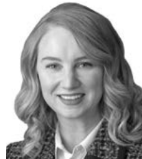
Sen. Megan Hunt