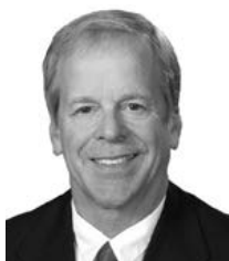
Sen. Tom Briese

not exceed the previous year's request multiplied by 103 percent. The limit would apply to property tax requests set in 2022 through 2027.