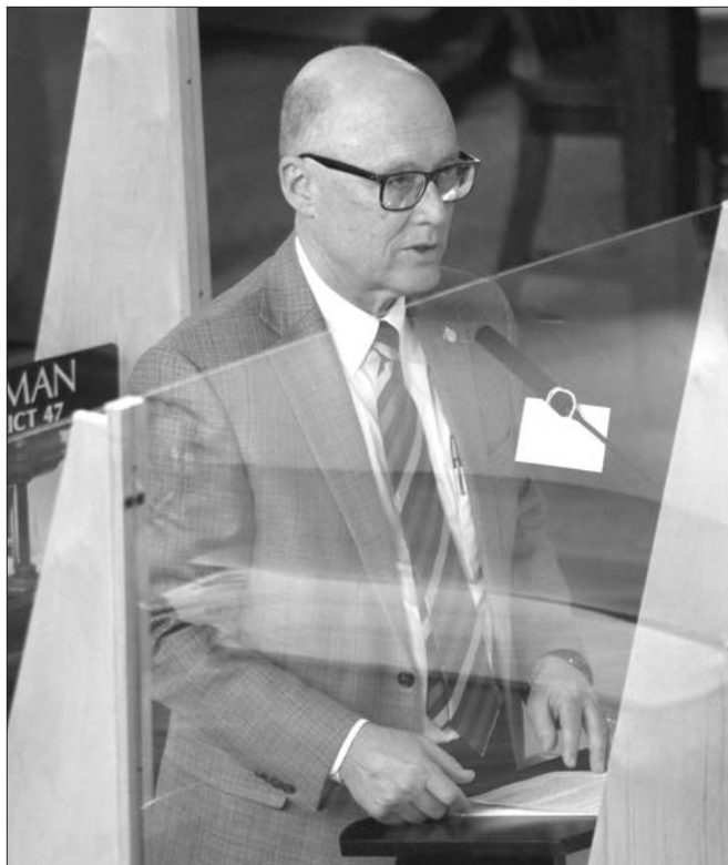
Sen. John Arch, chairperson of the Health and Human Services Committee

Senators expanded state benefits for low-income Nebraskans, reformed youth rehabilitation and treatment centers and addressed a variety of licensure issues this session.