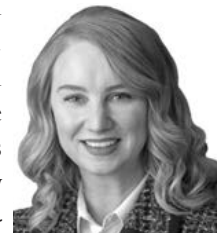
Sen. Megan Hunt