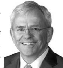
Sen. Steve Lathrop