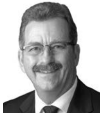
Sen. Bruce Bostelman