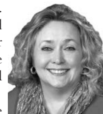
Sen. Carol Blood

Finally, the committee advanced a bill to general file