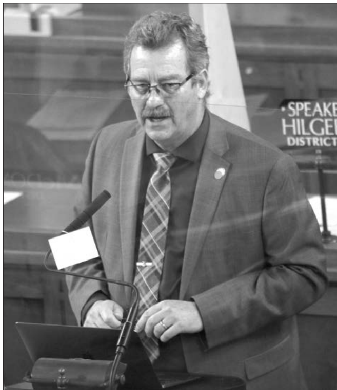
Sen. Bruce Bostelman, chairperson of the Natural Resources Committee

Proposals to ban the use of treated seed in ethanol production and create a legal framework for carbon dioxide sequestration were among the measures advanced by the Natural Resources Committee this session.