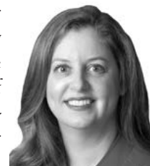
Sen. Wendy DeBoer

LB485, introduced by Bennington Sen. Wendy DeBoer, increases the income eligibility limit for the determination of initial eligibility for assistance under the Child Care Subsidy program from 130 percent of FPL to 185 percent. The bill, passed 31-6, also increases income eligibility for transitional child care assistance from 185 percent of FPL to 200 percent.