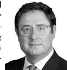
Sen. Michael Flood

Local political subdivisions have greater flexibility to meet virtually under LB83, introduced by Norfolk Sen. Michael Flood. The bill allows authorized political subdivisions to hold meetings virtually during a declared emergency. The bill defines virtual conferencing as a meeting conducted electronically or by phone.