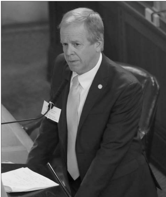
Sen. Tom Briese, chairperson of the General Affairs Committee

Senators established casino gaming regulations, permanently legalized to-go alcohol sales authorized during the pandemic and expanded the type of fireworks that can be sold in Nebraska.