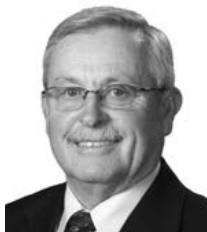
Sen. Steve Erdman

A pending Revenue Committee amendment instead would limit the total amount of credits available each year