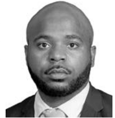
Sen. Terrell McKinney

LB451, sponsored by Omaha Sen. Terrell McKinney, expands the definition of race in the Nebraska Fair Employment Practice Act to include characteristics associated with race such as skin color, hair texture and protective hairstyles. The bill defines protective hairstyles as braids, locks and twists.