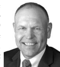
Sen. Tom Brandt

LB306, introduced by Sen. Tom Brandt of Plymouth, increases the eligibility threshold for the low income home energy assistance program from 130 percent of FPL to 150 percent. The bill also requires the state Department of Health and Human Services to allocate at least 10 percent of program funds to weatherization assistance.