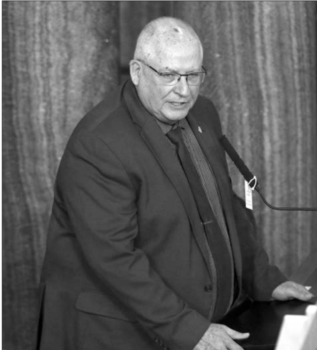
Sen. Curt Friesen, chairperson of the Transportation and Telecommunications Committee

Of the transportation and telecommunications issues considered this session, senators prioritized rural broadband development, lower administrative fees and expanded license plate options.