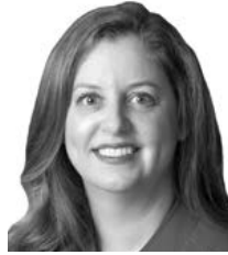
Sen. Wendy DeBoer