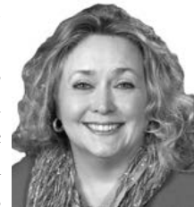
Sen. Carol Blood