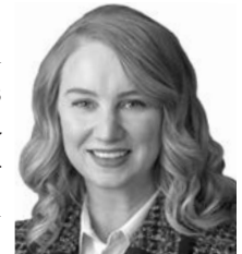
Sen. Megan Hunt