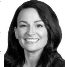
Sen. Jen Day

Among those measures is LB84, introduced by Omaha Sen. Jen Day, which extends eligibility for Supplemental Nutrition Assistance Program benefits. SNAP eligibility in Nebraska currently is set at 165 percent of the federal poverty level, but was scheduled to drop to 135 percent of FPL on Oct. 1, 2023.