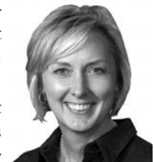
Sen. Lynne Walz