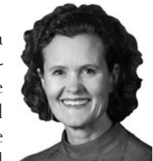
Sen. Jana Hughes

LB376 passed on a 41-0 vote and took effect immediately. ■