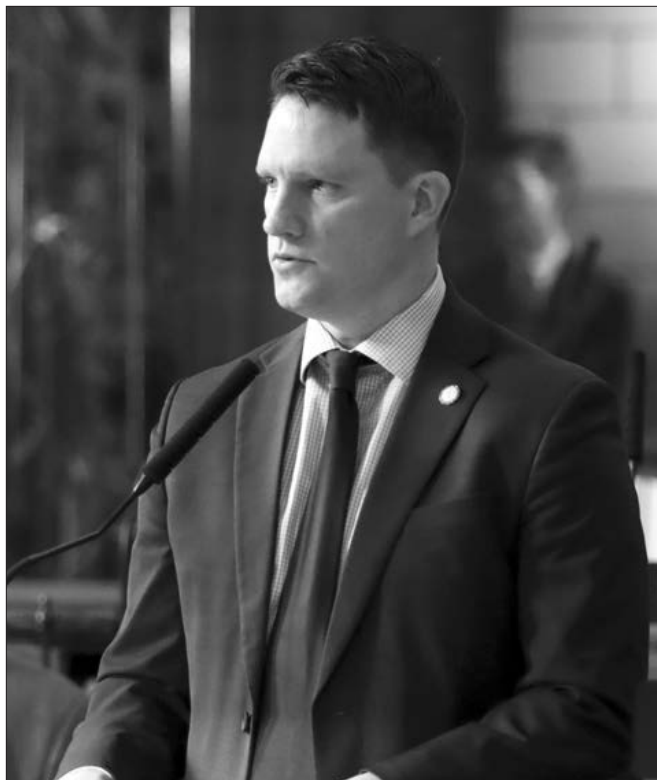
Sen. Ben Hansen, chairperson of the Health and Human Services Committee

Measures intended to restrict abortion and gender affirming care for minors, address the state’s health care workforce shortage and increase access to behavioral health services were among the proposals considered by the Health and Human Services Committee.