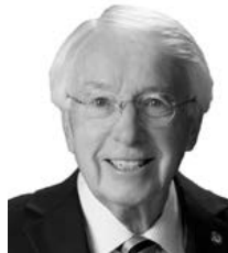
Sen. Merv Riepe