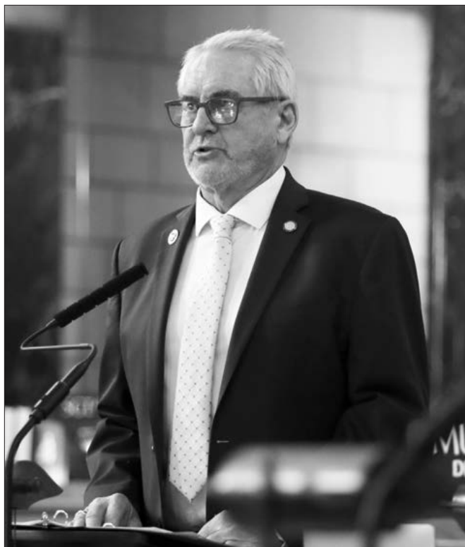
Sen. Dave Murman, chairperson of the Education Committee

The state will direct approximately $300 million per year in additional funding to K-12 public schools under a bill advanced by the Education Committee this session.