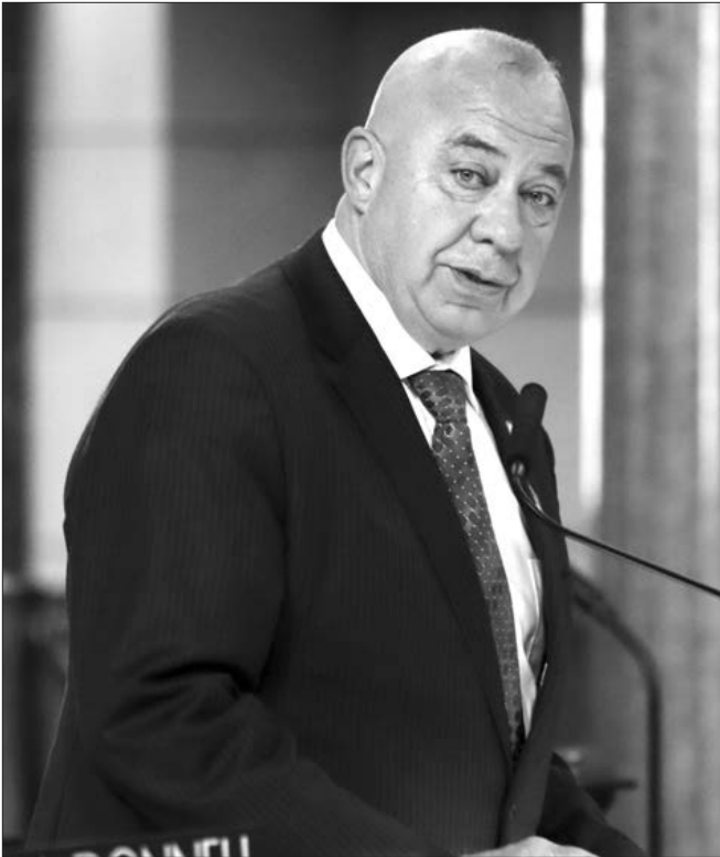
Sen. Tom Brewer, chairperson of the Government, Military and Veterans Affairs Committee

Establishing a legal framework for the state's new photo ID voting requirement, earlier restoration of felon voting rights and a state holiday honoring Malcolm X were among the measures considered by the Legislature this session.