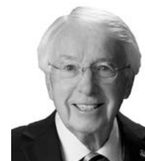
Sen. Merv Riepe