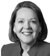
Sen. Jane Raybould

Under the measure, the portion of the fee previously allocated to the state General Fund instead is redirected to the Department of Motor Vehicles Cash Fund.