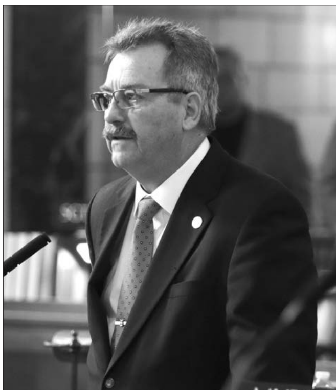
Sen. Bruce Bostelman, chairperson of the Natural Resources Committee

B ills supporting Nebraska's efforts to be selected as a regional clean hydrogen hub, authorizing a state agency to use alternative contracting methods and increasing Nebraska Oil and Gas Conservation Commission members' pay were among those advanced by the Natural Resources Committee this session.