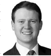
Sen. Beau Ballard