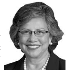
Sen. Rita Sanders