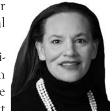
Sen. Danielle Conrad

A bill that would have extended the deadline for studies evaluating horse racing and casino gaming in Nebraska remains in committee.