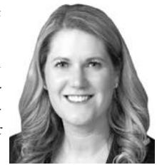
Sen. Carolyn Bosn