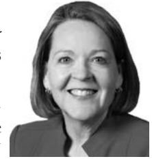
Sen. Jane Raybould

Both bills were advanced to general file by the committee but were not scheduled for debate this session. ■