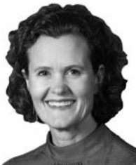
Sen. Jana Hughes

ment to purchase and loan textbooks – including digital, electronic or online resources – to children enrolled in kindergarten to twelfth grade of an approved private school;