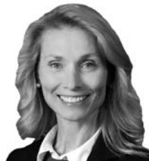
Sen. Christy Armendariz

imum of $400 for eligible individuals and from $150 to $200 for an additional disabled family member;