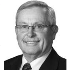
Sen. Steve Erdman

Finally, an amended version of Bayard Sen. Steve Erdman's LB28 reinstates a fourth, at-large member of the Tax Equalization and Review Commission. The measure allows a single commissioner to hear appeals when the taxable value of a parcel is $2 million — an increase from $1 million — and increases commissioners' pay by tying it to the salary set for the chief justice and judges of the Nebraska Supreme Court.