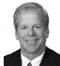
Sen. Tom Briese