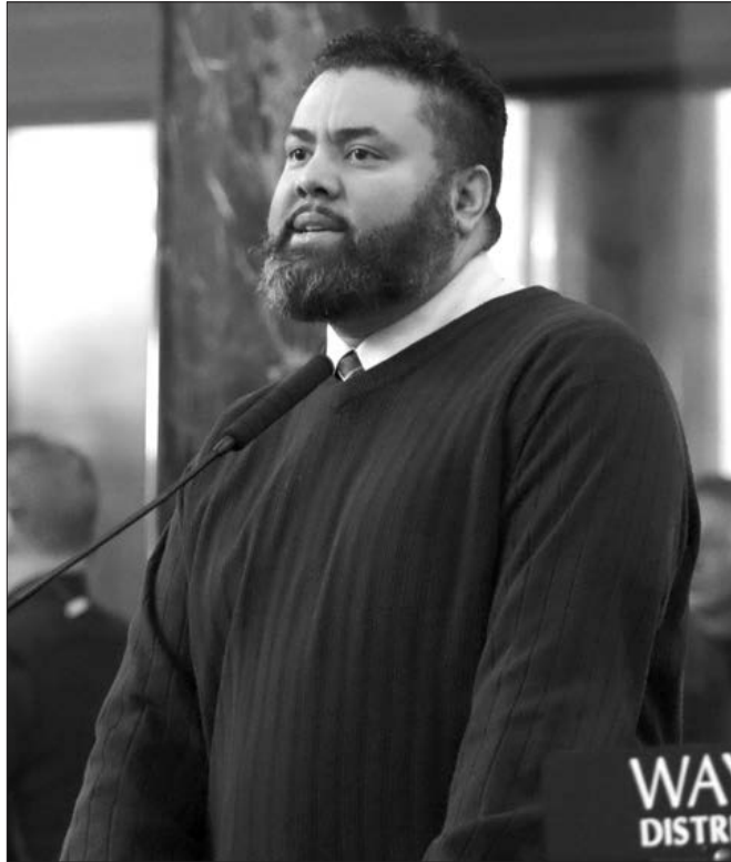
Sen. Justin Wayne, chairperson of the Judiciary Committee

R epeal of the state’s concealed handgun permit requirement, continuing efforts to enact criminal justice reforms and an increase in judges’ salaries topped the list of judicial topics considered by senators this session.