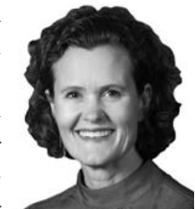
Sen. Jana Hughes