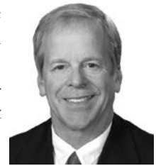
Sen. Tom Briese

At the November 2022 general election, Nebraskans voted to increase the state minimum wage from $9 to