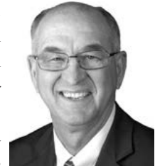
Sen. Myron Dorn