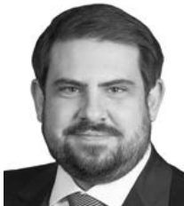
Sen. Eliot Bostar