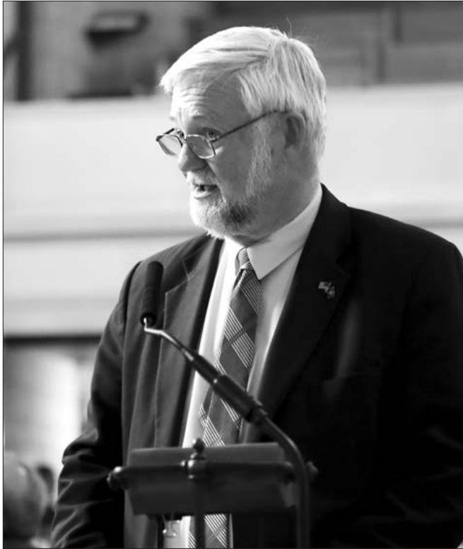
Sen. John Lowe, chairperson of the General Affairs Committee

Measures to expand keno play and track alcoholic products being imported into the state were among those advanced by the General Affairs Committee and packaged into two omnibus bills this session.