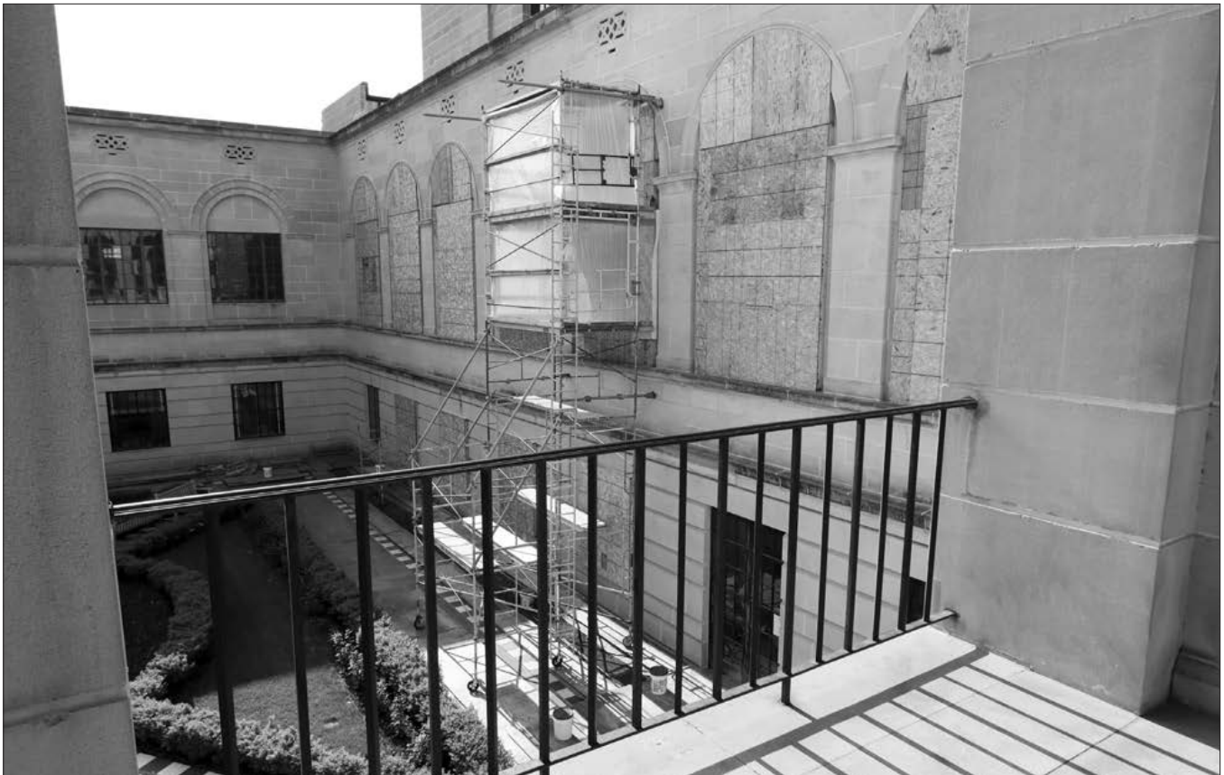
Many senators whose offices have been temporarily relocated during the Capitol's ongoing HVAC renovation are preparing to return to their previous locations as the project enters the fourth of five planned phases.

PRESRT STD U.S. POSTAGE PAID LINCOLN, NE PERMIT NO. 212