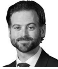
Sen. George Dungan