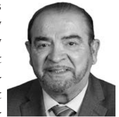
Sen. Raymond Aguilar