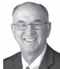
Sen. Myron Dorn

After several hours of debate over two days, lawmakers voted 33-0 to advance LB254 to select file. ■