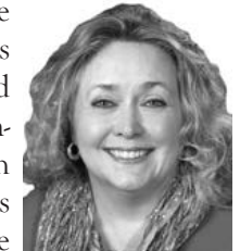
Sen. Carol Blood