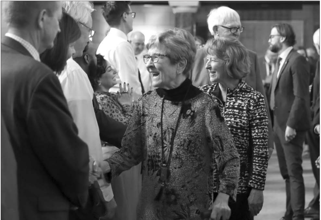
Former state senators were invited to the George W. Norris Legislative Chamber April 19 to be recognized by the Legislature.

PRESRT STD U.S. POSTAGE PAID LINCOLN, NE PERMIT NO. 212