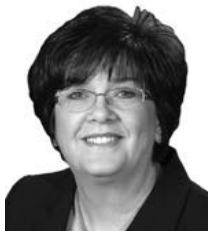
Sen. Joni Albrecht

LB933, introduced by Thurston Sen. Joni Albrecht, would have become operative contingent upon one of the three national “triggering” events: if the U.S. Supreme Court overturns Roe v. Wade , Congress enacts a law giving states complete authority to regulate abortion or the U.S. Con-