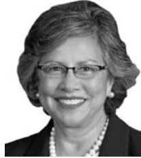
Sen. Rita Sanders