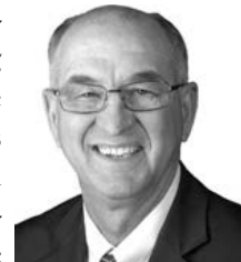
Sen. Myron Dorn