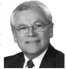
Sen. Steve Halloran

LR14, introduced last year by Hastings Sen. Steve Halloran, is Nebraska's application for a convention of the states authorized under the U.S. Constitution. If 34 states commit to a convention, states could propose amendments to the U.S. Constitution to impose fiscal restraints, limit the power and jurisdiction of the federal government and impose term limits on members of Congress.