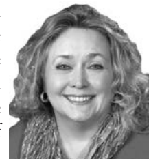
Sen. Carol Blood

Under LR159, sponsored by Bellevue Sen. Carol Blood, the proposed committee would have consisted of nine members of the Legislature, appointed by the Executive Board. The committee would have been authorized to hold hearings and issue subpoenas to compel attendance of witnesses and production of accounts, documents and testimony.