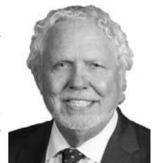
Sen. Rich Pahls