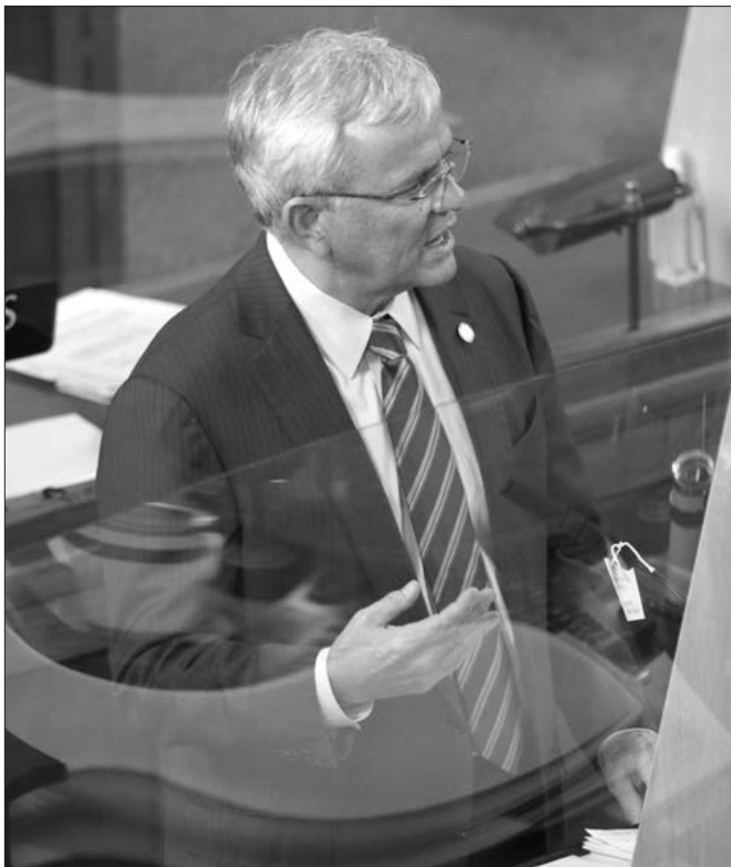
Sen. Steve Lathrop, chairperson of the Judiciary Committee

Police accountability, criminal justice reform and tenant housing security were among the measures considered by members of the Judiciary Committee this session.