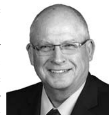
Sen. Curt Friesen

LB454 failed to advance to select file on a vote of 23-12. Twenty-five votes were needed.