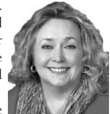
Sen. Carol Blood

Finally, the committee advanced a bill to general file