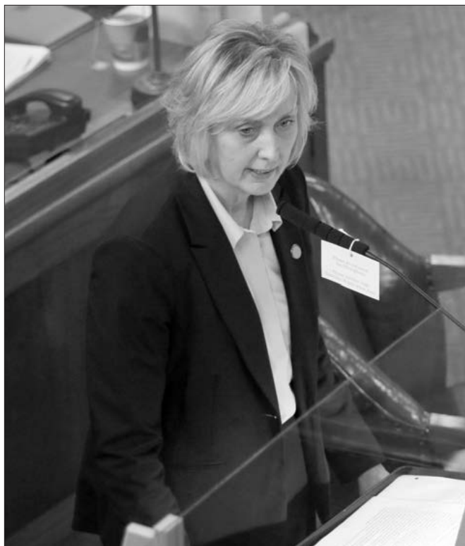
Sen. Lynne Walz, chairperson of the Education Committee

Measures to create a school safety reporting system, establish a statewide farm-to-school program and require schools to create health plans for students with seizure disorders were among the proposals advanced by the Education Committee this session.