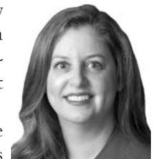
Sen. Wendy DeBoer