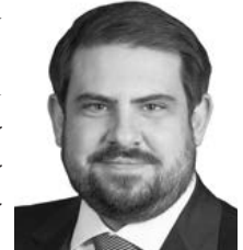
Sen. Eliot Bostar