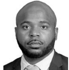
Sen. Terrell McKinney

LB451, sponsored by Omaha Sen. Terrell McKinney, expands the definition of race in the Nebraska Fair Employment Practice Act to include characteristics associated with race such as skin color, hair texture and protective hairstyles. The bill defines protective hairstyles as braids, locks and twists.