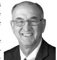
Sen. Myron Dorn

The additional revenue would have funded Simulation in Motion, a University of Nebraska Medical Center training simulation that prepares first