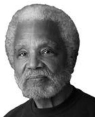
Sen. Ernie Chambers

The law requires a landowner in counties that have adopted a management plan to effectively manage prairie dog colonies on his or her property to prevent them from expanding to adjacent property if the neighboring property owner objects to the expansion. If such unwanted expansion occurs, the county board issues a notice to the landowner to take control measures.