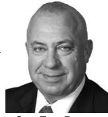
Sen. Tom Brewer

Current law permits the use of scrap tires if they are processed into material for artificial turf, playground surfaces and residential and garden applications, among other uses. ■