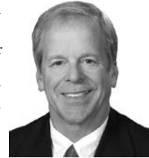
Sen. Tom Briese

LB967, introduced by North Platte Sen. Mike Groene, would have removed a provision of community development law allowing undeveloped vacant land within a three-mile radius of the city limits to be acquired for redevelopment when it is not located in an area deemed blighted or substandard.