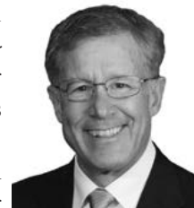
Sen. John McCollister

Under the bill, each jail can establish a prepaid or collect telephone system, or a combination of both. Inmates' family members can deposit money into a prepaid account with a third-party provider of telephone services to cover the cost of the call.