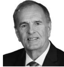
Sen. Roy Baker