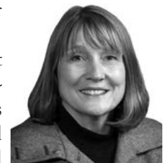
Sen. Lydia Brasch

LB804, introduced by Bancroft Sen. Lydia Brasch, would have allowed contributions to Nebraska's educational savings plan to be used to pay tuition at private and parochial elementary and secondary schools. ■