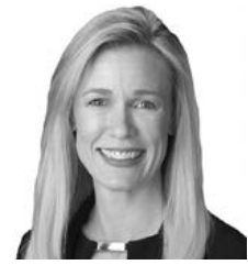
Sen. Theresa Thibodeau

Murante offered an additional amendment that would have specified that if the U.S. Census asks the citizenship question in 2020, that information would have been used to obtain the count of noncitizens required in the bill. If