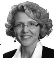
Sen. Sue Crawford

The department also is required to make reasonable efforts to place siblings together, even if there is no preex-