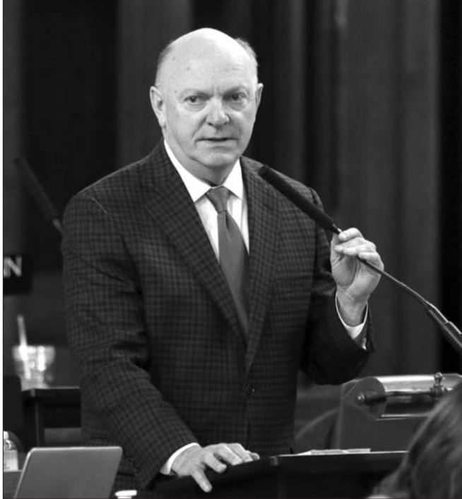
Sen. Jim Smith, chairperson of the Revenue Committee

The Revenue Committee advanced bills this session that update the state's tax code to reflect federal changes, expand a tax credit for volunteer emergency responders and index for inflation the thresholds used when calculating the income tax liability of Nebraskans who receive Social Security benefits.