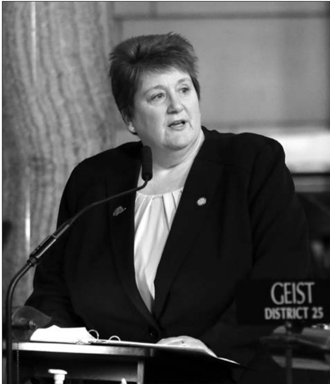
Sen. Laura Ebke, chairperson of the Judiciary Committee

Senators passed measures this session to provide additional oversight of the state correctional system, ensure fair treatment for minors engaged in the court system and address the state's opioid epidemic.