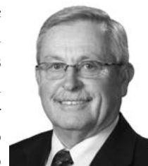
Sen. Steve Erdman

LB713, introduced by Sen. Steve Erdman of Bayard, increases pay for those serving on the Nebraska Oil and Gas Conservation Commission, which regulates the state's oil and natural gas exploration and production industry. It raises the per diem for commissioners from $50 to $400 and increases the annual pay cap from $2,000 to $4,000.