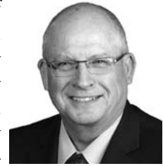
Sen. Curt Friesen

Introduced by Sen. Curt Friesen of Henderson last session, LB98 would have extended the three-cent levy authority for NRDs located in fully or over-appropriated river basins from FY2017-18 to FY2025-26. The levy may be used only for ground water management and integrated management programs under the Nebraska Ground Water Management and Protection Act.