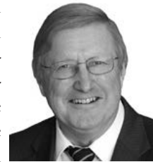
Sen. Paul Schumacher

LR269CA, introduced by Columbus Sen. Paul Schumacher, would have placed the issue on the November 2018 general election ballot. If approved by voters, the Legislature would have been constitutionally authorized to delegate complete or partial sovereignty to an area of the state, not to exceed 36 square miles in area, with a population density of 10 people per square mile. The sovereignty agreement would not have exceeded 99 years.