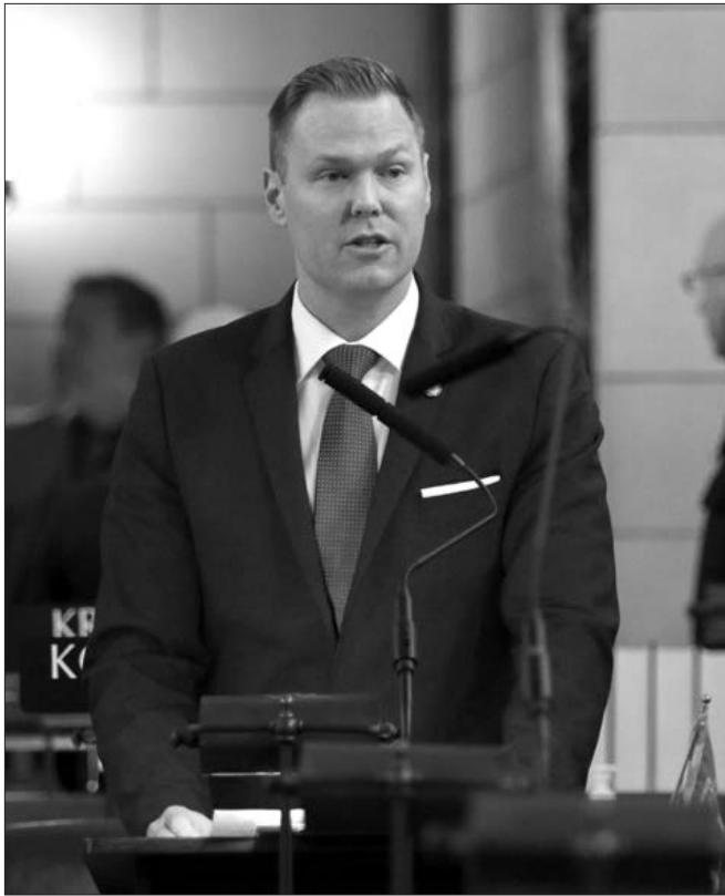
Sen. Brett Lindstrom, chairperson of the Banking, Commerce and Insurance Committee

The provision of health insurance to individuals in temporary custody and rules governing property appraisers, public adjusters and payday and short-term lenders were among the topics considered by the Banking, Commerce and Insurance Committee this session.