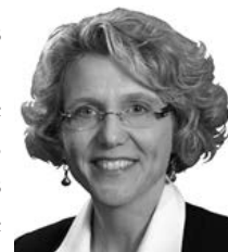
Sen. Sue Crawford