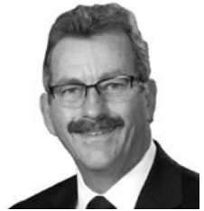
Sen. Bruce Bostelman