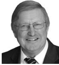
Sen. Paul Schumacher