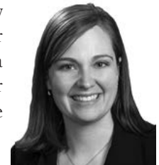
Sen. Sara Howard

Provisions of LB188, introduced by Omaha Sen. Sara Howard, allow for the parent of a child conceived as a result of a sexual assault to petition for termination of parental rights of the perpetrator.