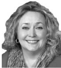
Sen. Carol Blood

Introduced by Bellevue Sen. Carol Blood, LB88 allows military spouses to obtain temporary licensure in Nebraska in a variety of health professions under the Uniform Credentialing Act.