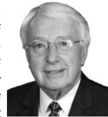
Sen. Merv Riepe

LB73, introduced by Ralston Sen. Merv Riepe, would raise the legal age from 18 to 21 to purchase cigarettes, cigars, vapor products, alternative nicotine products and smokeless tobacco. The bill was considered by the General Affairs Committee but was not advanced. ■