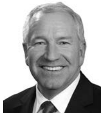
Sen. Dan Watermeier

If the seller opts not to collect the tax, it would be required to notify Nebraska purchasers that tax is due and that the state requires them to file a sales or use tax return on their purchases. Each failure to notify would result in a $5 penalty.