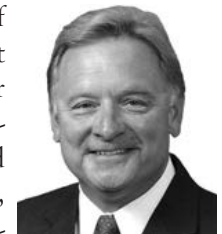
Sen. Bob Krist

Introduced by Sen. Bob Krist of Omaha, LB9 creates a task force that will develop minimum standards for radon-resistant new construction in Nebraska. The standards will be designed so they can be enforced by a county, city or village as part of its local building code.