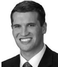
Sen. Tyson Larson

apply to a receive a "wind-energy friendly" designation.