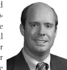
Sen. Burke Harr

Omaha Sen. Burke Harr introduced LB492, passed 47-0, which allows an operator of a self-storage facility to impose a lien on all of an occupant's personal property located at the facility to recover delinquent rent, late fees and other charges related to the preservation, sale or disposition of the personal property.