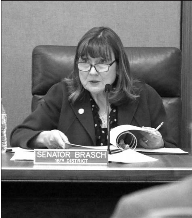
Sen. Lydia Brasch, chairperson of the Agriculture Committee

The Agriculture Committee considered bills this session clarifying the definition of hybrid seed corn, repealing the Black-Tailed Prairie Dog Management Act and supporting industrial hemp research.