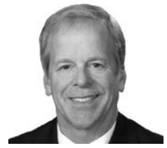
Sen. Tom Briese