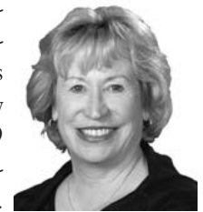
Sen. Lou Ann Linehan

Elkhorn Sen. Lou Ann Linehan introduced an amendment that replaced the bill. The amendment instead would eliminate mandatory minimum sentences only for Class IC and ID drug offenses, specifically for manufacturing between 28 and 139 grams of cocaine, heroin or methamphetamine with the intent to distribute.