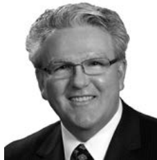
Sen. Jim Scheer