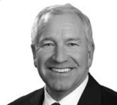
Sen. Dan Watermeier