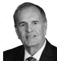
Sen. Roy Baker