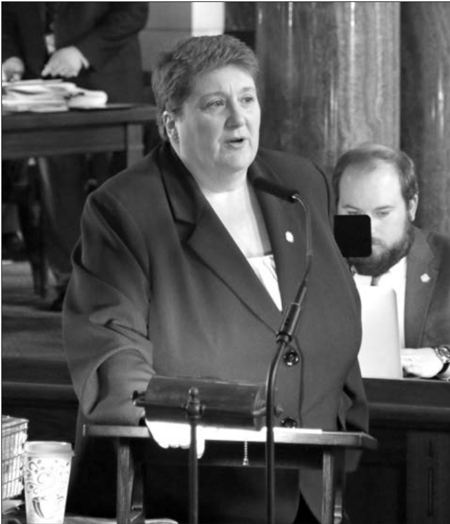
Sen. Laura Ebke, chairperson of the Judiciary Committee

Updating criminal penalties and modernizing court procedures were among the judiciary-related priorities for lawmakers this session.