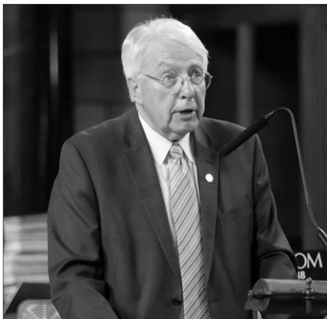
Sen. Merv Riepe, chairperson of the Health and Human Services Committee

B udget concerns related to the provision of public benefits, reduction of licensure requirements and regulation of prescription drugs were the top health and human services issues addressed by lawmakers this session.