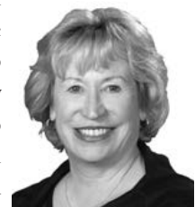
Sen. Lou Ann Linehan

LB267, introduced by Elkhorn Sen. Lou Ann Linehan, expands the influenza vaccination requirement to all nursing and skilled nursing facility employees. Facilities are not required to offer vaccines if contraindicated in an individual case or if there is a national vaccine shortage.