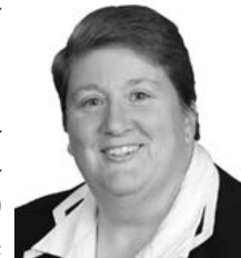
Sen. Laura Ebke

LB34, introduced by Crete Sen. Laura Ebke and passed 48-0, automatically allows access to the primary election ballot if a party has at least 10,000 registered members as indicated by state voting records.