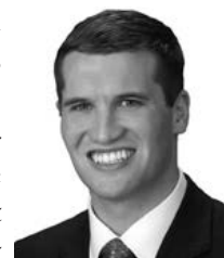
Sen. Tyson Larson

Nebraska's Coordinating Commission for Postsecondary Education would administer the program in conjunction with eligible institutions. The commission would determine criteria for the eligibility of award recipients and for setting the minimum and maximum size of the awards. It also would allocate the grants to the schools, which would distribute them to students. ■