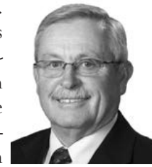
Sen. Steve Erdman

The bill removes a requirement that nurses educated in a foreign country pass a specific examination or hold a certificate from the Commission on Graduates of Foreign Nursing Schools. Instead, an applicant will be required to pass a board-approved examination and provide satisfactory evaluation from a board-approved foreign credentials evaluation service.