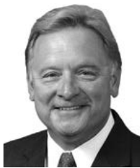
Sen. Bob Krist

LR127, introduced by Omaha Sen. Bob Krist and adopted 28-11, creates a new Nebraska Justice System Special Oversight Committee. The committee will continue to study the issues addressed by previous investigative committees and review the role of state agencies and their involvement in the justice system.