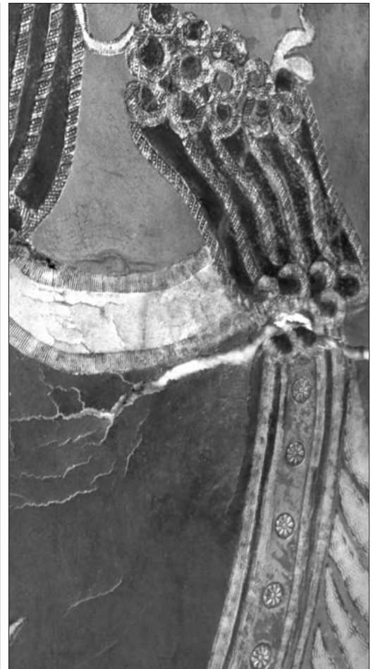
The George W. Norris Legislative Chamber doors, made with hand-tooled, hand-stenciled and painted leather, have been removed for reproduction by a local conservation expert. By reproducing the original design on new leather and applying that reproduction to the restored wooden door structure, the Office of the Capitol Commission will maintain the architectural and thematic integrity of the Capitol. The detail photo (right) shows how the leather has dried and cracked since installation in the 1920s.