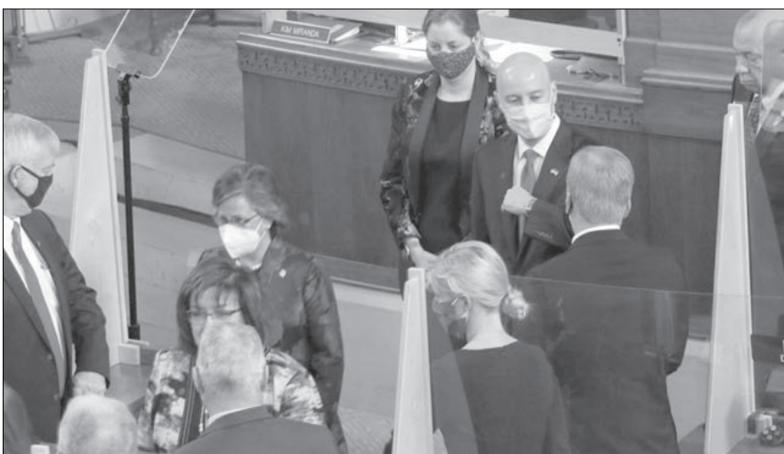
The governor greets senators as he makes his way from the legislative chamber.

"The pandemic has revealed how impossible work from home or remote education can be for those on the wrong side of the digital divide," Ricketts said. ■