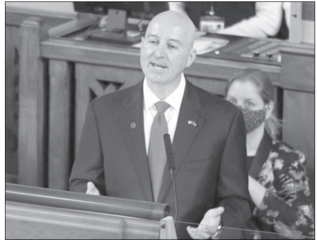
Gov. Pete Ricketts delivers his State of the State address.

Saying that the current Nebraska State Penitentiary is "decaying,"