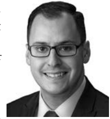
Sen. Andrew La Grone