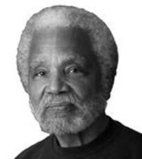
Sen. Ernie Chambers

Each agency is required to submit its adopted policy to the Nebraska Commission on Law