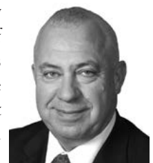
Sen. Tom Brewer

Self-employed child care providers may apply for a state