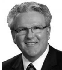
Sen. Jim Scheer

For calendar year 2020, the total amount of credits is