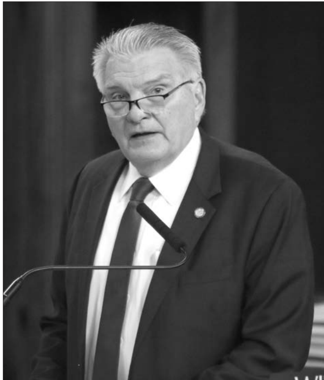
Sen. John Stinner, chairperson of the Appropriations Committee

Following the temporary suspension of the legislative session March 16, senators met briefly to provide emergency funding to combat the coronavirus pandemic in Nebraska.