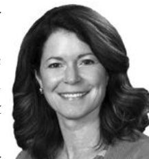
Sen. Suzanne Geist

The bill also allows the state Department of Motor Vehicles to discontinue