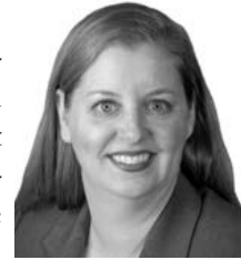
Sen. Wendy DeBoer