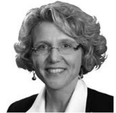
Sen. Sue Crawford