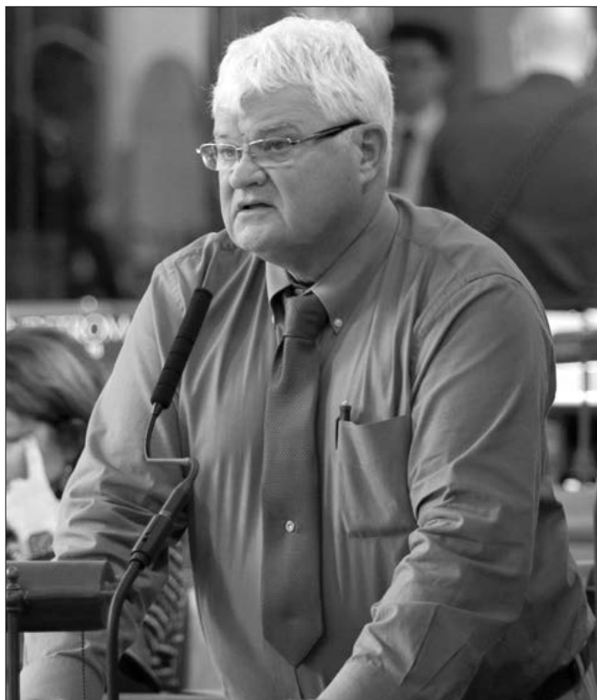
Sen. Mike Groene, chairperson of the Education Committee

The Education Committee advanced bills this session that require schools to provide injury leave to employees and create a policy that prohibits sexual contact between a teacher and a student.