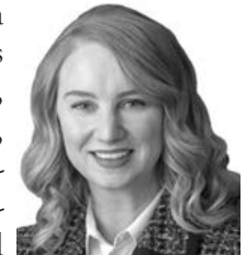
Sen. Megan Hunt