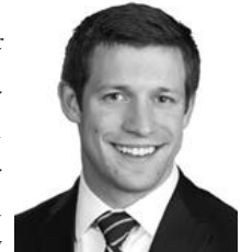
Sen. Adam Morfeld

The bill included provisions of LB1036, originally introduced by Lincoln Sen. Adam Morfeld, that changed the age of consent for health care decisions from 19 to 18. It also allowed a person under 19 who is in the custody of the correctional system to consent to medical and mental health care decisions.