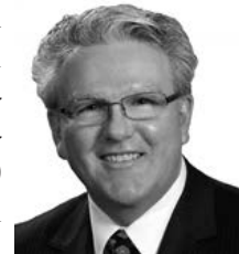
Sen. Jim Scheer

LR279CA, introduced by Sen. Jim Scheer of Norfolk, would have raised the maximum number of state senators authorized by the state constitution from 50 to 55. If approved by 30 senators, the measure would have been placed on the ballot for voter approval during the 2020 general election.