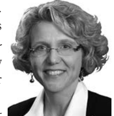
Sen. Sue Crawford

LB870, introduced by Bellevue Sen. Sue Crawford, allows cities and villages to borrow directly from a financial institution to repair or rebuild property or restore public services damaged or disrupted by a natural disaster.