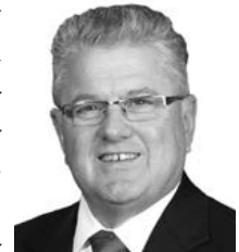
Sen. Mark Kolterman

Sen. Mark Kolterman of Seward introduced the original proposal, LB720, last session. Under LB1107, qualifying businesses will receive a varying combination of incentives based on their level of capital investment and the number of employees they hire at a minimum qualifying wage.