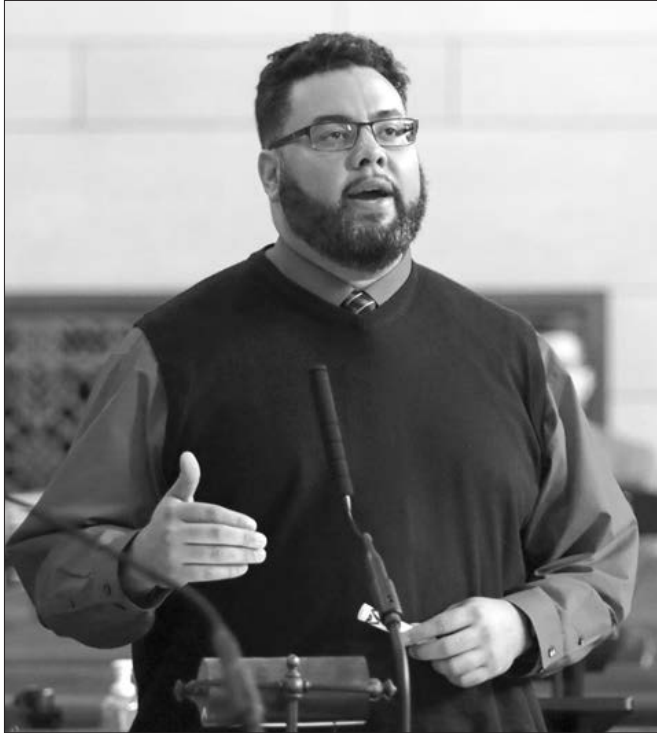
Sen. Justin Wayne, chairperson of the Urban Affairs Committee

Proposals to address blighted property, affordable housing needs and municipal law were among the topics taken up by the Legislature this session.