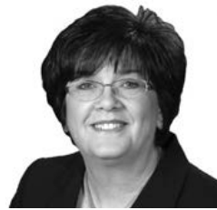
Sen. Joni Albrecht

man, which allows the state DMV to issue a salvage title for a vehicle manufactured prior to 1940 if it previously was titled as “junk;”