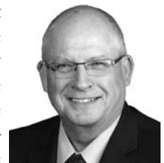
Sen. Curt Friesen