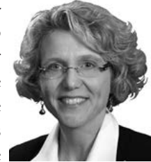
Sen. Sue Crawford

LB305, as introduced last session by Bellevue Sen. Sue Crawford, would have required employers with four or more employees to provide paid sick and safe leave. Under the proposal, employees would have accrued at least one hour of paid leave for every 30 hours worked. Employees could earn up to 40 hours of paid leave per year, based on hours worked.