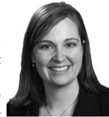
Sen. Sara Howard

The bill includes provisions of LR298, sponsored by Omaha Sen. Sara Howard, that create the Youth Rehabilitation and Treatment Center Special Oversight Committee of the Legislature.