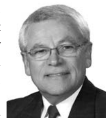
Sen. Steve Halloran

LB931, sponsored by Hastings Sen. Steve Halloran, expands the permit to apply to transport of grain directly from farm storage to market. The bill also allows single-axle trucks to exceed single axle and gross weight by up to 15 percent for transport from farm storage to market or factory, up to 70 miles.