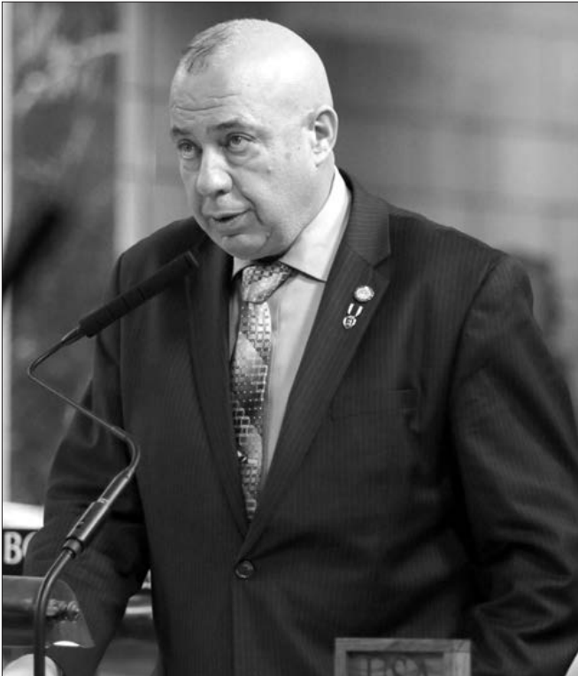
Sen. Tom Brewer, chairperson of the Government, Military and Veterans Affairs Committee

Senators created a statewide commission, added to an established state holiday and took up several election proposals this session.