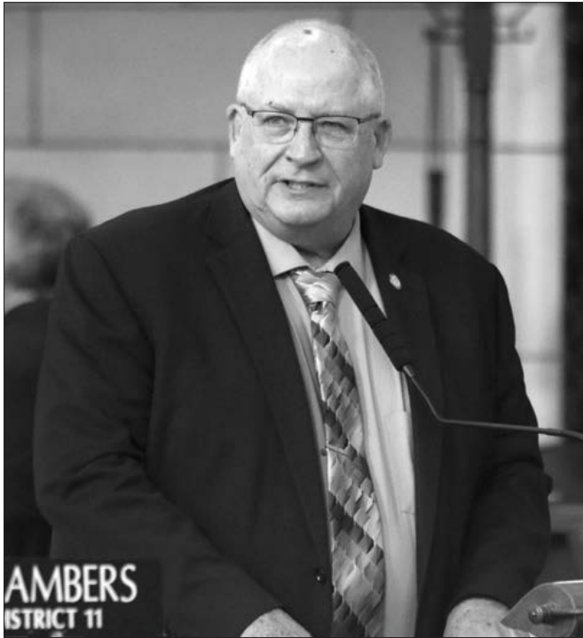
Sen. Curt Friesen, chairperson of the Transportation and Telecommunications Committee

Measures expanding broadband access, easing motor vehicle restrictions and addressing emerging technologies were considered by the Transportation and Telecommunications Committee this session.