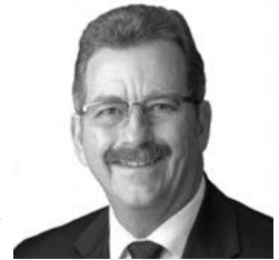
Sen. Bruce Bostelman