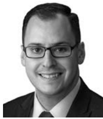
Sen. Andrew La Grone

Under LB1042, introduced by Sen. Andrew La Grone of Gretna, an individual’s federal adjusted gross income will be reduced by the amount of any contribution made by the individual’s employer into the individual’s Nebraska educational savings plan trust account.