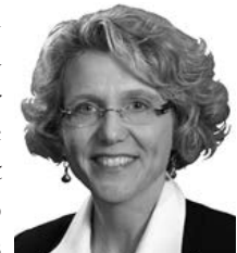
Sen. Sue Crawford