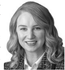
Sen. Megan Hunt