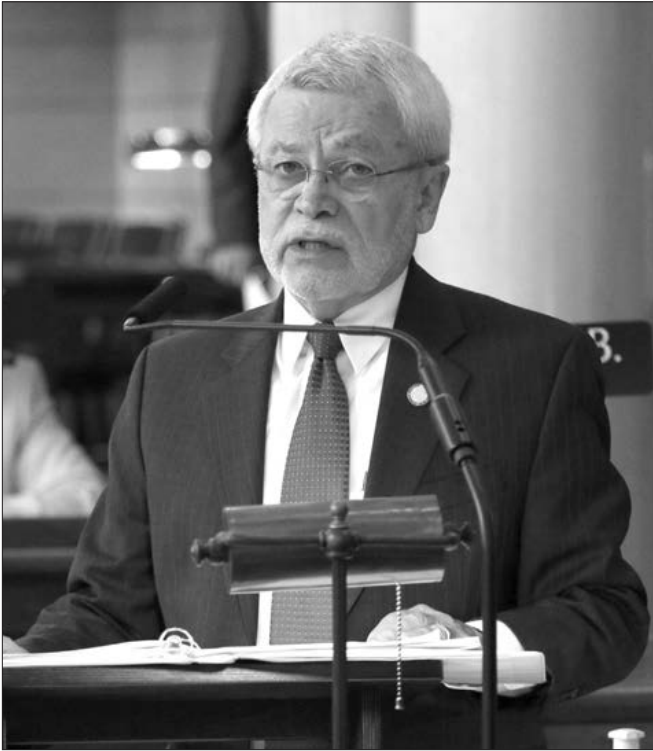
Sen. Steve Halloran, chairperson of the Agriculture Committee

Proposals to create a new checkoff program and update the Nebraska Hemp Farming Act were among those considered by the Agriculture Committee this session.