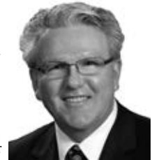
Sen. Jim Scheer

LR279CA, introduced by Sen. Jim Scheer of Norfolk, would raise the maximum number of state senators authorized by the state constitution from 50 to 55. If approved by 30 senators, the measure would be placed on the ballot for voter approval during the 2020 general election.