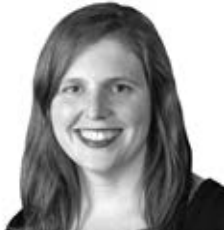
Sen. Machaela Cavanaugh

LB1060, sponsored by Omaha Sen. Machaela Cavanaugh, would expand the definition of race for purposes of employment discrimination to include traits historically associated with race, such as hair texture and protective hairstyles, including braids, locks and twists.