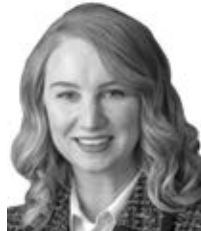
Sen. Megan Hunt

LB962, sponsored by Omaha Sen. Megan Hunt, would allow college athletes at public and private schools to earn money from their name, image and likeness rights. Only 2 percent of college and university athletes will go on to play professionally, Hunt said.