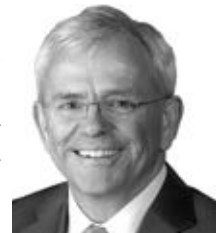
Sen. Steve Lathrop