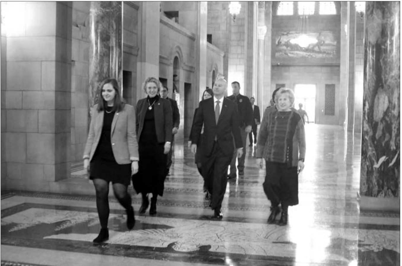
A delegation of senators escorts Gov. Pete Ricketts to the George W. Norris Legislative Chamber to deliver his State of the State address Jan. 15.

PRESRT STD U.S. POSTAGE PAID LINCOLN, NE PERMIT NO. 212