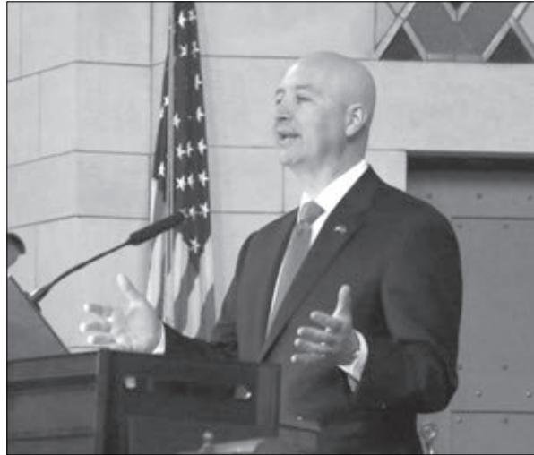
Gov. Pete Ricketts delivered his State of the State address Jan. 15.

Many areas of the state are still recov-