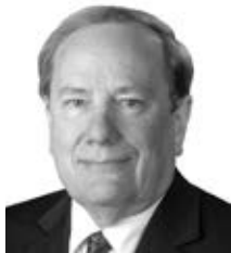
District 22, Columbus Sen. Mike Moser

Office: Room 2000, State Capitol Lincoln, NE 68509 (402) 471-2673 mhilgers@leg.ne.gov