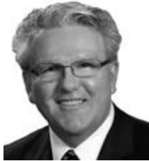
District 19, Norfolk Sen. Jim Scheer

Office: Room 2010, State Capitol Lincoln, NE 68509 (402) 471-2929 jscheer@leg.ne.gov