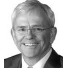
District 12, Omaha Sen. Steve Lathrop

Office: Room 1302, State Capitol Lincoln, NE 68509 (402) 471-2612