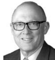
District 14, La Vista Sen. John Arch

Office: Room 1212, State Capitol Lincoln, NE 68509 (402) 471-2727 jwayne@leg.ne.gov