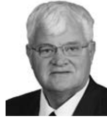
District 42, North Platte Sen. Mike Groene

Office: Room 1019, State Capitol Lincoln, NE 68509 (402) 471-2631 tbriese@leg.ne.gov