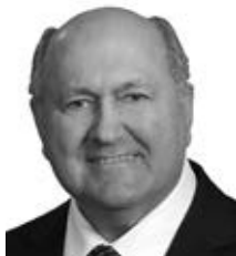
District 31, Omaha Sen. Rick Kolowski

Office: Room 1208, State Capitol Lincoln, NE 68509 (402) 471-2620 mdorn@leg.ne.gov