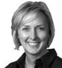
District 15, Fremont Sen. Lynne Walz

Office: 8th Floor, State Capitol Lincoln, NE 68509 (402) 471-2730 jarch@leg.ne.gov