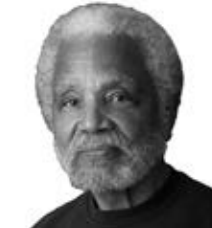
District 11, Omaha Sen. Ernie Chambers

Office: 11th Floor, State Capitol Lincoln, NE 68509 (402) 471-2718 wdeboer@leg.ne.gov