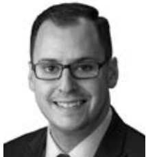
District 49, Gretna Sen. Andrew La Grone

Office: Room 1004, State Capitol Lincoln, NE 68509 (402) 471-2802 jstinner@leg.ne.gov