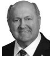
Sen. Rick Kolowski

Sen. Rick Kolowski, would require the state to reimburse school districts at least 80 percent of the total excess allowable costs for those programs and services. Kolowski said the state currently reimburses schools for approximately 48 percent.