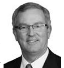
Sen. Dan Hughes

As introduced by Sen. Dan Hughes of Venango, LB758 would require state natural resources districts and interlocal entities that buy private land for the development of a streamflow augmentation project to work with the county in which the project is located to reduce the project's impact on the local property tax base.