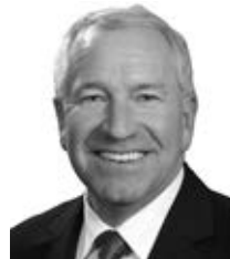
Sen. Dan Watermeier

LB980, introduced by Syracuse Sen. Dan Watermeier, would authorize the state Department of Transportation or the Nebraska State Patrol to issue special permits allowing the transportation of hay bales up to 12 feet wide on the interstate during daylight hours.