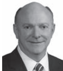
Sen. Jim Smith

The top corporate income tax rate, assessed on businesses with income in excess of $100,000, would decrease from 7.81 percent to 6.75 percent in 2019. The rate would fall to 6.69 percent in 2020. The lower corporate