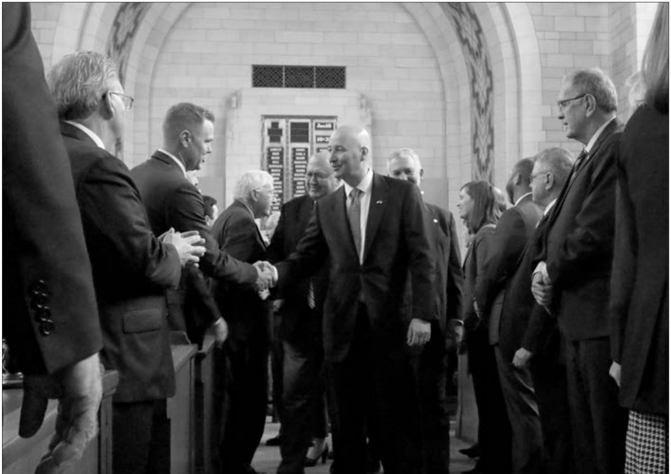
Gov. Pete Ricketts is greeted by senators after delivering his State of the State address Jan. 10.

PRESRT STD U.S. POSTAGE PAID LINCOLN, NE PERMIT NO. 212