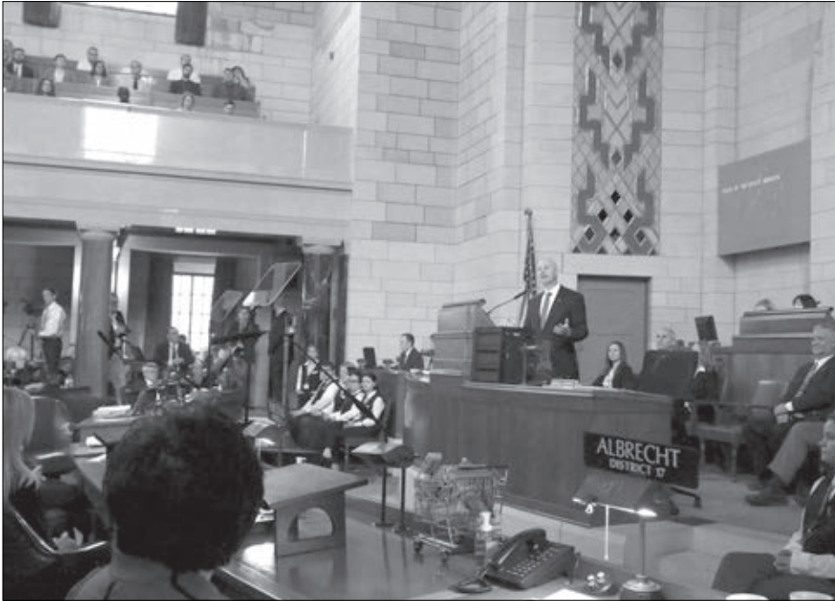
Gov. Pete Ricketts delivers his State of the State address to senators and guests Jan. 10.

W ith a focus on encouraging economic development, providing tax relief and streamlining government, Gov. Pete Ricketts delivered his State of the State address Jan. 10.