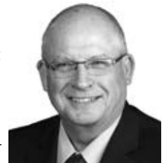
Sen. Curt Friesen