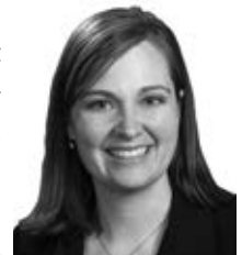
Sen. Sara Howard

Currently, the governor is tasked with appointing an individual to serve when a vacancy occurs in the Legislature. LB777, introduced by Omaha Sen. Sara Howard, would require that the individual chosen be selected from a pool of applicants. To be considered eligible for such an appointment, an individual would be required to file an application with the governor’s office