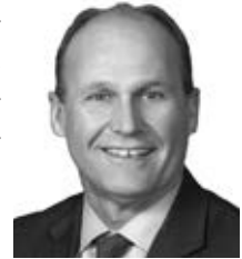
Sen. Dan Quick

to continue indefinitely. Quick said prospective employers looking to locate in Nebraska are concerned with the availability of public transportation.