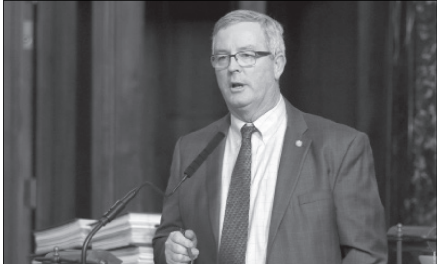
Sen. Dan Hughes said his proposal would allow streamflow augmentation projects to make payments in lieu of property taxes to affected counties.

A pending Natural Resources Committee amendment would replace the bill and instead would authorize NRDs and interlocal entities to make voluntary payments in lieu of taxes to the county. The amount of the payments would not exceed the property taxes that would have been paid if the land were subject to taxation.