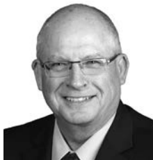
Sen. Curt Friesen

The bill contains provisions of LB996, originally introduced by Henderson Sen. Curt Friesen, which place limitations on who can own an interest in, operate or control a franchise, franchisee or consumer care facility. Excluded from such ventures are vehicle manufacturers that own or