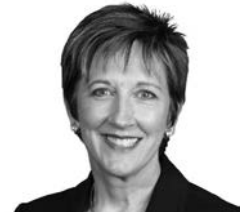
Sen. Patty Pansing Brooks