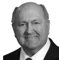
Sen. Rick Kolowski

At least two public hearings on the plan are required. The commission will present the plan to the Legislature