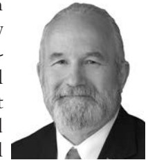
Sen. Tommy Garrett

Bellevue Sen. Tommy Garrett introduced LB1106 to address the state's civil forfeiture law, which allows law enforcement to seize property associated with suspected criminal activity without necessarily filing criminal charges. The bill allows law enforcement agencies to dispense seized currency and property only after securing a criminal conviction. Persons not charged with a crime or later acquitted of a crime could recoup their property under the bill.