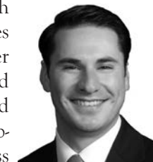
Sen. Heath Mello