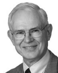
Sen. Ken Haar

Under LB1070, introduced by Sen. Ken Haar of Malcolm, the Nebraska Oil and Gas Conservation Commission would have required proof of liability insurance of at least $1 million before issuing a permit for the drilling of an injection or recovery well. A commercial disposal facility that disposes of more than 500 barrels of injection well wastewater a day would have been required to have at least $5 million in liability insurance.