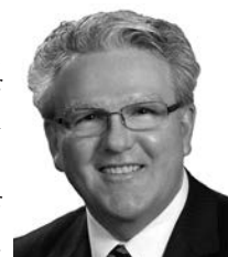
Sen. Jim Scheer

Krist's motion to invoke cloture failed 29-14, ending further consideration of the bill. Thirty-three votes were needed. ■