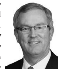
Sen. Dan Hughes