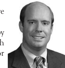
Sen. Burke Harr