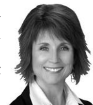
Sen. Nicole Fox