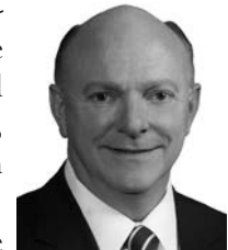
Sen. Jim Smith

The bank fund will receive a one-time transfer of $50 million from the state's cash reserve in July 2016. More than $400 million in state motor fuel tax generated be-