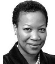
Sen. Tanya Cook