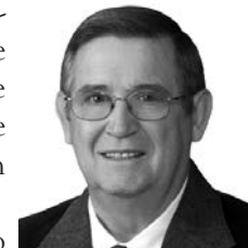
Sen. Dave Bloomfield