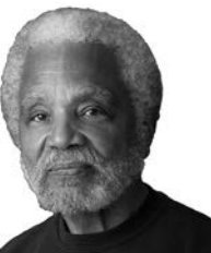
Sen. Ernie Chambers