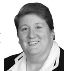
Sen. Laura Ebke

Crete Sen. Laura Ebke introduced LB289, which would have repealed individual city and village ordinances governing the registration,