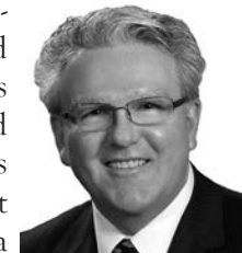
Sen. Jim Scheer

The state requires that each motor vehicle display both a front and back license plate, with exemptions for certain vehicles. LB53, introduced by Norfolk Sen. Jim Scheer, broadens the exemption to include vehicles not manufactured to be equipped with a front license plate bracket.