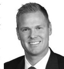
Sen. Brett Lindstrom

The agency could use no more than 5 percent of its annual gross revenue averaged over the previous three years for the transactions. It could use only funds designated for the investments—not facilities or other assets—and the agency's governing body must authorize any hedging agreement.