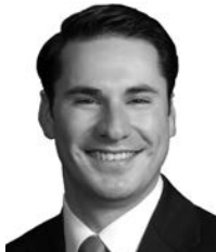
Sen. Heath Mello

LB1012, introduced by Omaha Sen. Heath Mello, allows municipalities to create clean energy assessment districts. Property owners within such districts are eligible to apply for financing through the municipality to make energy efficiency and renewable energy improvements on residential, commercial and industrial properties.