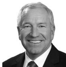
Sen. Dan Watermeier