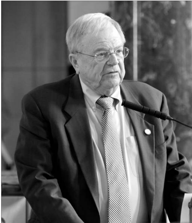
Sen. Les Seiler, chairperson of the Judiciary Committee

Senators passed measures this session that will provide a more transparent grand jury process, prevent civil forfeiture without criminal charges and ensure wage equality for all Nebraskans.