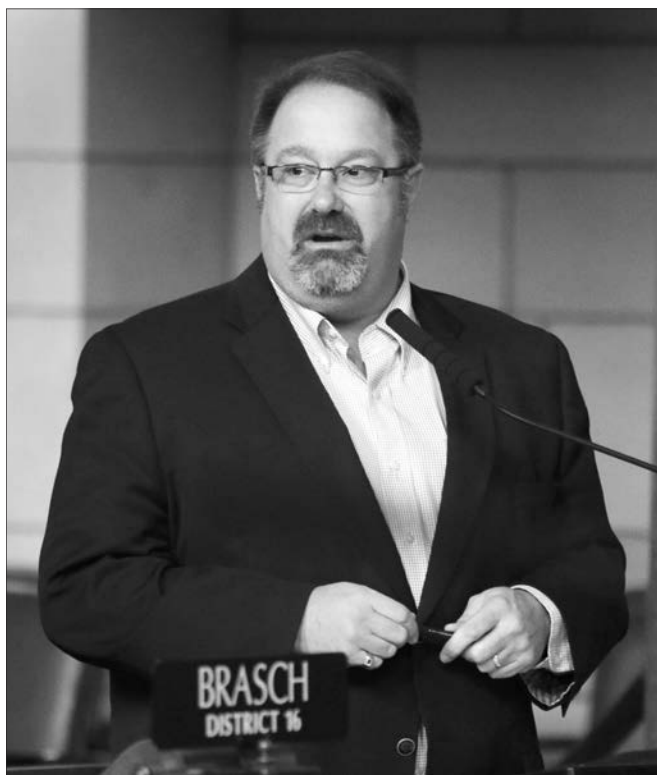
Sen. Ken Schilz, chairperson of the Natural Resources Committee

Private wind energy development, oil and gas regulations and preservation of the state's waterways topped the list of issues considered this session by the Legislature's Natural Resources Committee.