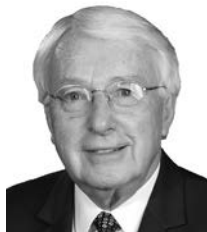
Sen. Merv Riepe

Among other provisions, the bill stipulates that a practitioner in a direct primary care agreement is prohibited from billing a patient in any form for primary care services provided under the contract. It also requires a practitioner