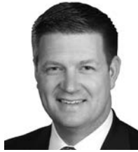
Sen. Beau McCoy

have reinstated a winner-take-all system and award all five electoral votes to the winner of the state's popular vote. After extended debate, McCoy offered a cloture motion, which failed on a vote of 32-17, one vote short of the number required.