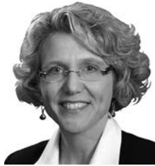
Sen. Sue Crawford

Under the bill, any individual working for a covered employer—any employer subject to employment security law—could elect coverage, upon which a payroll tax would be deducted from the individual’s wages. The amount to be deducted would not exceed one-half of 1 percent of the individual’s wages in any 12-month period.