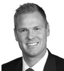
Sen. Brett Lindstrom

The bill defines a lookalike substance as one that is not specifically categorized as a controlled substance but pos-