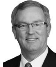
Sen. Dan Hughes

The bill incorporates provisions from LB711, introduced by Sen. Dan Hughes of Venango, that reestablish a task force with the goal of eradicating invasive plant species that reduce stream flows. The task force will be allocated $1 million per year beginning in FY2016-17.