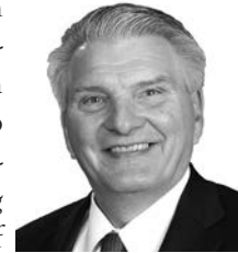
Sen. John Stinner

LB714, introduced by Sen. John Stinner of Gering, would have expanded the circumstances under which a surface water appropriation could go unused for its originally intended purpose without the appropriation being cancelled by the state Department of Natural Resources.