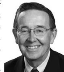
Sen. Al Davis

LB826, introduced by Sen. Al Davis of Hyannis, would have required the state Department of Education to reimburse school districts for at least 80 percent of the total excess allowable costs for special education programs and support services. Excess allowable costs are the costs to educate a student with a disability that exceed the average annual amount spent per student.