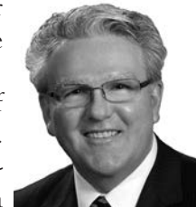
Sen. Jim Scheer