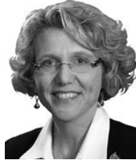
Sen. Sue Crawford

Sen. Sue Crawford of Bellevue introduced LB754, which establishes the Commission on Military and Veterans Affairs to protect the state's military installations, attract new missions and serve Nebraska's military members and veterans.