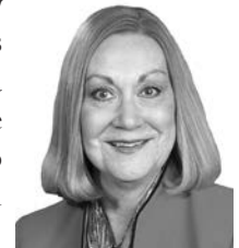
Sen. Joni Craighead