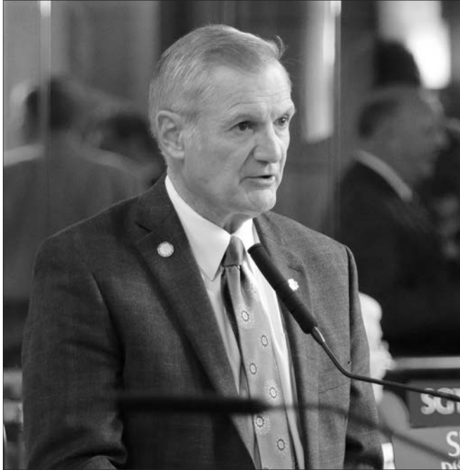
Sen. Mike Gloor, chairperson of the Revenue Committee

The Legislature's Revenue Committee considered bills this session that would provide agricultural property tax relief, grant tax credits for early childhood education professionals and modify arena turnback tax provisions.