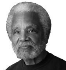
Sen. Ernie Chambers

The bill was indefinitely postponed by the committee on a 6-0 vote.