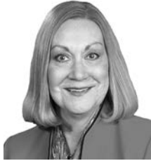
Sen. Joni Craighead

Under LB131, introduced by Omaha Sen. Joni Craighead and approved 46-0, expenditures by an SID will be restricted for 90 days upon receiving notification of a city or village's intent to annex.