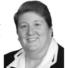
Sen. Laura Ebke

Sen. Laura Ebke of Crete introduced LR35, which called for a convention of the states, authorized under Article V of the U.S. Constitution. Congress would be compelled to call a convention of the states if a two-thirds majority—34 states—pass identical resolutions.