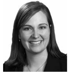
Sen. Sara Howard

LR418, introduced by Omaha Sen. Sara Howard and adopted 26-7, creates the ACCESSNebraska Oversight Committee to provide oversight and ongoing dialogue between the Legislature and the state Department of Health and Human Services (DHHS) to ensure continued improvement of the system.