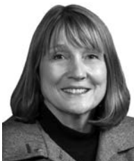
Sen. Lydia Brasch