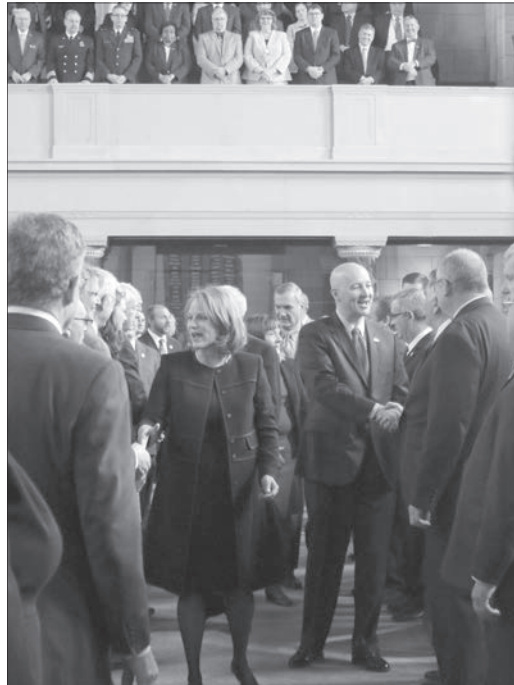
Gov. Pete Ricketts and First Lady Susanne Shore greet senators before the Governor's State of the State address Jan. 14.

Ricketts' remarks also praised the spirit of volunteerism in Nebraska and the work that agencies have done to