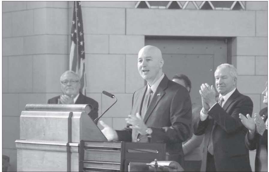
Gov. Pete Ricketts shared his priorities with lawmakers during his State of the State address.

Ricketts said his proposal would tighten current spending limits on local governments, control growth