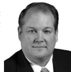
Sen. Scott Lautenbaugh

LB951 , introduced by Omaha Sen. Scott Lautenbaugh, clarifies that a lump sum settlement that is not required to be submitted for approval by the state Workers' Compensation Court shall be final and conclusive unless procured by fraud.