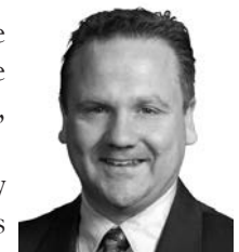
Sen. Colby Coash