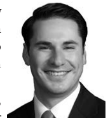
Sen. Heath Mello