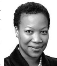
Sen. Tanya Cook

Lawmakers passed a bill that affects workers' compensation and unemployment benefits. LB961 , introduced by Omaha Sen. Tanya Cook, originally would have enabled workers injured due to willful negligence of their employers to seek damages outside of the Nebraska Workers' Compensation Act.