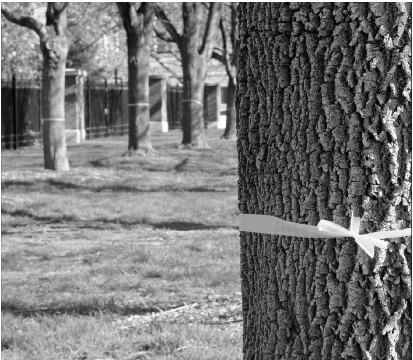
Students from Lincoln's McPhee Elementary tied green ribbons around ash trees on Capitol grounds in honor of Earth Day, April 22. The ribbons raise awareness of the emerald ash borer, a destructive insect species which poses a threat to Nebraska's ash trees in the coming years.

PRESRT STD U.S. POSTAGE PAID LINCOLN, NE PERMIT NO. 212