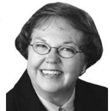
Sen. Kathy Campbell

LB89, introduced by Lincoln Sen. Kathy Campbell, increases the maximum ADC benefit each year through 2019, after which it will be set at 70 percent of the standard need. The bill also changes the amount of gross earned income that is disregarded for ADC applicants, increasing it to 50 percent once eligibility is established.