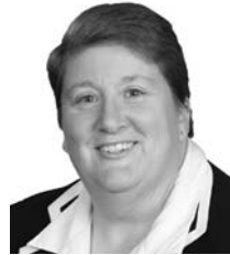
Sen. Laura Ebke