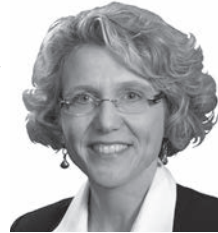
Sen. Sue Crawford

Bellevue Sen. Sue Crawford, chairperson of the committee, brought an amendment on select file that made several changes to the bill.