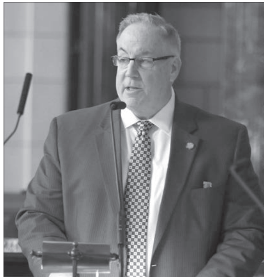
Sen. Bill Kintner said a penalty of death is an appropriate form of justice for the most violent crimes.

Sen. Tanya Cook of Omaha disagreed that having a death penalty provides additional protections. She said her district has not seen any decrease in violent crime as a result of the death penalty, so it is not serving as a deterrent. The issue seems to be more about revenge than protection, she added.