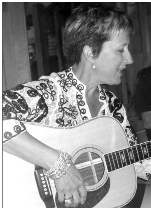
The senator enjoys playing guitar in her spare time.

children leaving for college this year and years of wide-ranging community involvement under her belt, the time was right take her civic endeavors to the next level.