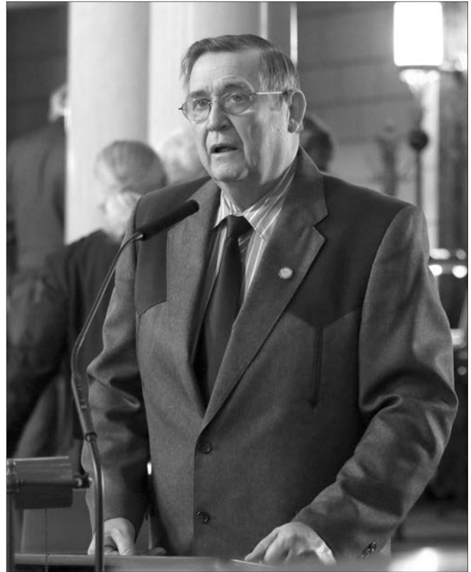
Sen. Dave Bloomfield said Nebraska’s motorcycle helmet law infringes on individual freedom.

said that the medical costs to treat severe brain injuries can be more than $3 million over a patient’s lifetime. Expenses not covered by insurance are passed on to taxpayers, she said.