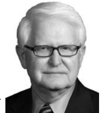
Sen. Bill Avery