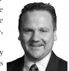
Sen. Colby Coash