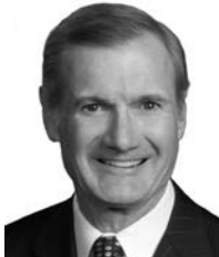
Sen. Mike Gloor

Under LB935 , introduced by Grand Island Sen. Mike Gloor, the Legislature would have had the authority to approve or deny a major relocation of a state agency or service from one community to another. A request for relocation would have included a justification for the relocation, a review of the long-term costs, measurable goals for improving the quality of the service and an assessment of the feasibility of alternatives within the state agency to moving the service.