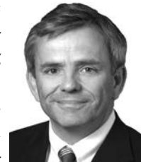
Sen. Steve Lathrop