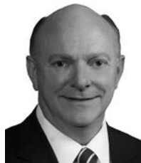
Sen. Jim Smith

and pedals for propulsion by human power, an electric bicycle features an electric motor producing up to 750 watts, up to one brake horsepower and a maximum speed of 20 mph.