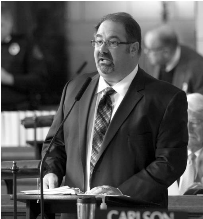
Sen. Ken Schilz, Agriculture Committee chairperson

Livestock producers will operate under new procedures implemented as a result of legislation heard by the Legislature's Agriculture Committee.