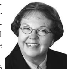
Sen. Kathy Campbell

LR422 , introduced by Campbell, builds on a resolution adopted by the Legislature in 2013, which designated the Health and Human Services Committee—in cooperation with the Banking, Commerce and Insurance Committee—to evaluate the state's health care system.