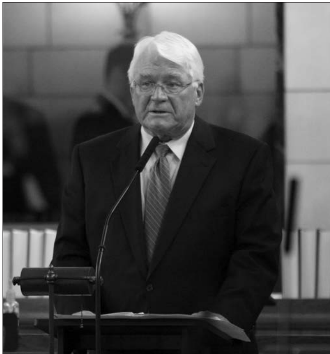
Sen. Galen Hadley, chairperson of the Revenue Committee

After several public hearings across the state during the 2013 interim, the Legislature's Tax Modernization Committee identified property and income tax relief as top priorities for the 2014 legislative session.