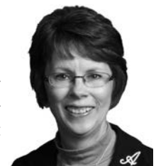
Sen. Annette Dubas

LR400 , introduced by Fullerton Sen. Annette Dubas, establishes the ACCESSNebraska Special Investigative Committee of the Legislature. ACCESSNebraska is an online and call center system developed by the state Department of Health and Human Services (DHHS) and implemented in 2009 to determine