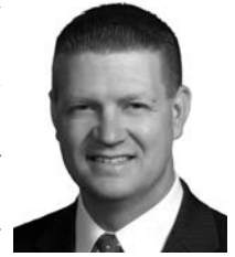
Sen. Beau McCoy

The bill passed on a 43-0 vote and will go into effect Jan. 1, 2015.