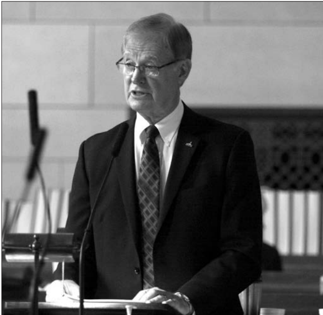
Sen. Tom Carlson, chairperson of the Natural Resources Committee