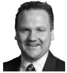
Sen. Colby Coash

LB908 , introduced by Lincoln Sen. Colby Coash, primarily: