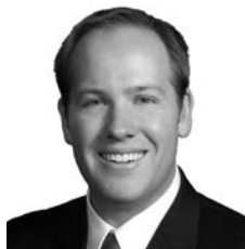
Sen. Jeremy Nordquist

Senators rejected a measure to increase the minimum wage in Nebraska. Introduced by Omaha Sen. Jeremy Nordquist, LB943 would have increased the minimum wage for all workers incrementally from $7.25 per hour to $9.00 by 2017.