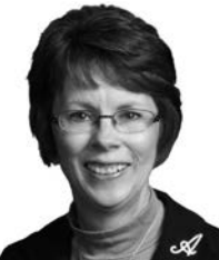
Sen. Annette Dubas