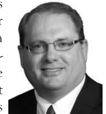
Sen. Russ Karpisek

Introduced by Wilber Sen. Russ Karpisek, LB998 lowers the penalty for using a vehicle not equipped with an ignition interlock device for those restricted to driving only vehicles with the device. Ignition interlock devices prevent a vehicle from starting if the driver has a blood-alcohol level of .03 or higher.