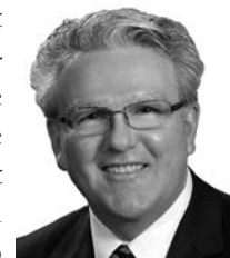
Sen. Jim Scheer

Senators passed the bill on a 43-0 vote.