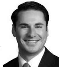
Sen. Heath Mello