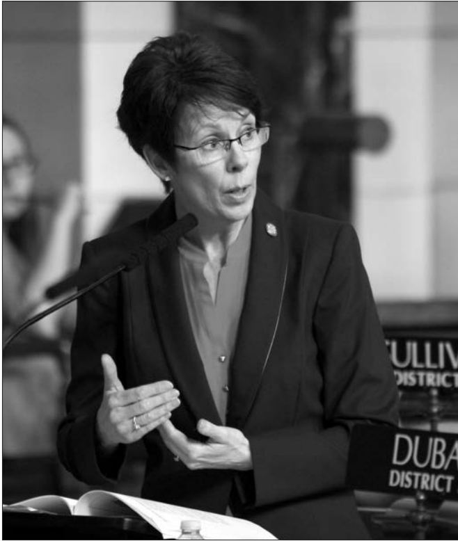
Sen. Annette Dubas, chairperson of the Transportation and Telecommunications Committee

Senators considered legislation regarding motorcycle helmets, specialty license plates and texting while driving, among other topics this session.