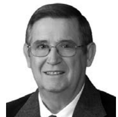
Sen. Dave Bloomfield

Bloomfield filed a motion on general file to invoke cloture, which would cease debate and force a vote on the bill. The motion failed on a 25-22 vote, as 33 votes