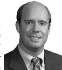
Sen. Burke Harr

In counties of at least 150,000 people, two or more vacant or unimproved lots owned by the same person in the same tax district and held for sale or resale now can be included in one parcel for property tax purposes. The measure directs county assessors to use the discounted cash-flow analysis method, in addition to the income approach, when determining property taxes.