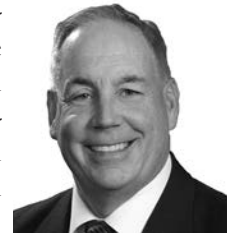
Sen. Bill Kintner