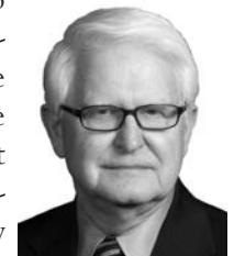
Sen. Bill Avery

The provisions of LB932 , introduced by Lincoln Sen. Bill Avery, were incorporated into LB907 , which passed 46-0 and made numerous changes to Nebraska's prisoner rehabilitation program. The provisions prohibit the state from asking job applicants to disclose their criminal history until the applicant has been determined to meet the minimum employment qualifications. Law enforcement agencies are exempt from the restriction, as are school districts when the criminal record relates to sexual or physical abuse.