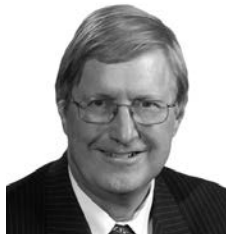
Sen. Paul Schumacher

As originally introduced by Columbus Sen. Paul Schumacher, LB788 originally dealt with security interest in government bond-pledged revenue sources. The original provisions were amended out of the bill and replaced with provisions of the following bills.