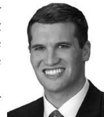
Sen. Tyson Larson

The bill also consolidates current hunter education programs to form one program covering all hunting implements including firearms, crossbows, bows and arrows and air guns. Those applying for bow hunter permits will be required to take additional bow hunter education programming.