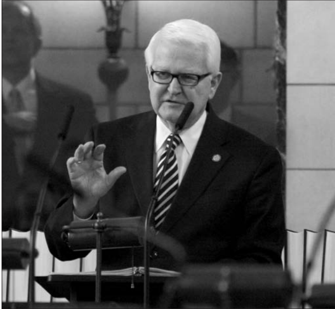
Government, Military and Veterans Affairs Committee chairperson Sen. Bill Avery

Changes to state agency reporting, election laws and voting procedures were enacted this session.