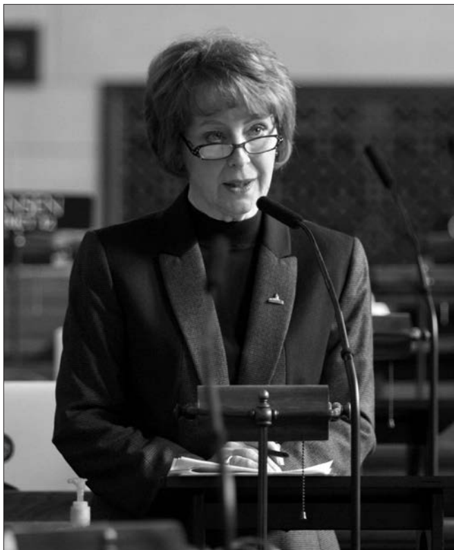
Sen. Kate Sullivan, Education Committee chairperson

Safety and accountability were priorities of the Legislature's Education Committee while considering legislation this session.