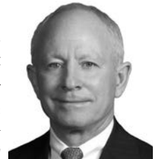
Sen. Greg Adams