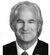
Sen. Tommy Garrett

LB1083 , introduced by Bellevue Sen. Tommy Garrett, would have increased the maximum amount of job training grants for employers who hire recently separated veterans. Employers would have received an additional $2,500 or $5,000 to train each recently separated veteran.