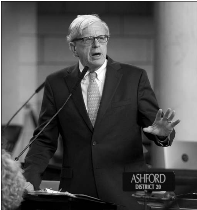
Sen. Brad Ashford, chairperson of the Judiciary Committee

L awmakers passed extensive changes to Nebraska's criminal and juvenile justice systems this session.