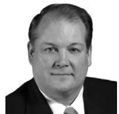
Sen. Scott Lautenbaugh

LB951 , introduced by Omaha Sen. Scott Lautenbaugh, clarifies that a lump sum settlement that is not required to be submitted for approval by the state Workers' Compensation Court shall be final and conclusive unless procured by fraud.