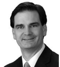
Sen. Pete Pirsch

Omaha Sen. Pete Pirsch introduced LB1087 , passed 48-0, which provides a 100 percent property tax exemption for a veteran with an honorable or general discharge who is drawing compensation for a 100 percent disability but is not eligible for the existing total homestead exemption.