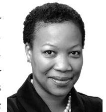
Sen. Tanya Cook

LB359, sponsored by Omaha Sen. Tanya Cook, would increase the percentage of a household's gross earned income that must be dis-