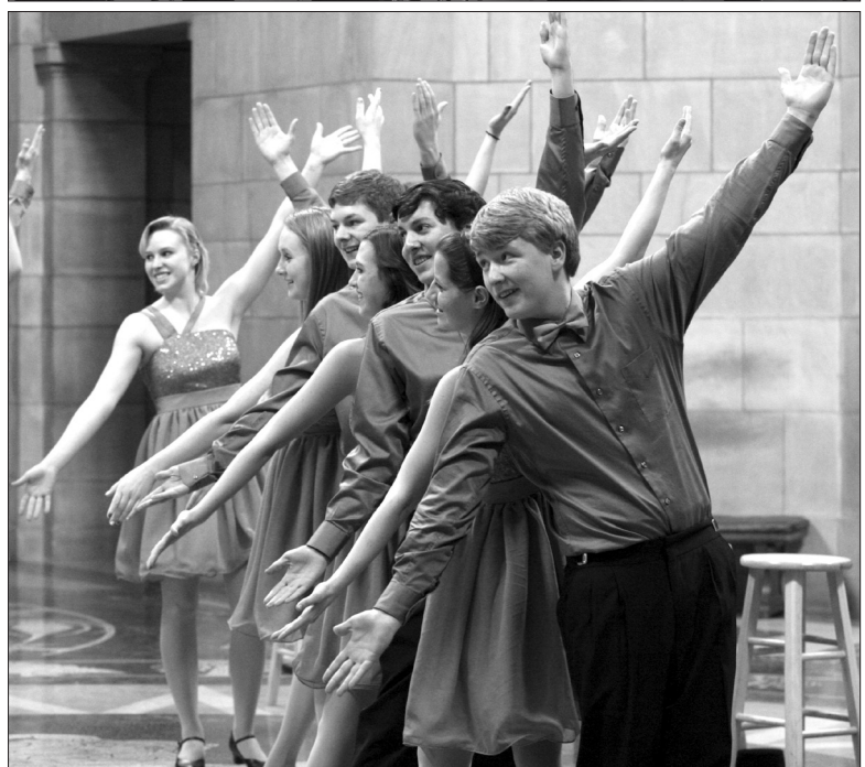
During Music Education Week at the Capitol, students from across the state shared their musical talents while performing in the Rotunda.