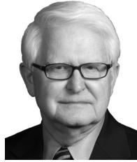
Sen. Bill Avery

A Government, Military and Veterans Affairs Committee amendment, adopted 28-0, places the commission