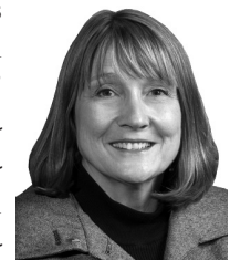
Sen. Lydia Brasch

Under LB144, as introduced by Bancroft Sen. Lydia Brasch, any candidate who loses a primary election decision “by lot” for county, city, village or school district office would be eligible as a write-in candidate in the general election for the same office.