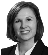
Sen. Kate Bolz

to measure the efficacy of the training program and report to the Legislature annually.