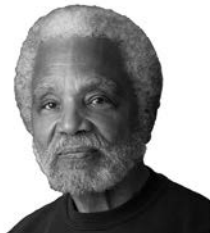
Sen. Ernie Chambers

Hailing the prairie dog as a species native to Nebraska that provides numerous ecological benefits, Chambers criticized the current law as unnecessary.