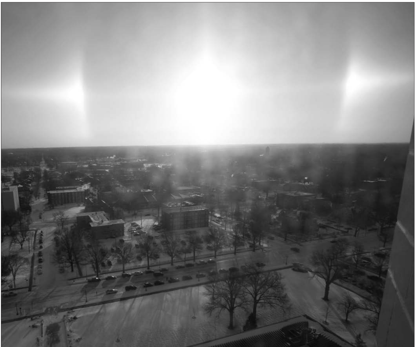
With the bitter cold and icy weather in Lincoln, conditions were right Wednesday morning for the appearance of parhelia, or “sun dogs” in the morning sky. In this view from the tower of the State Capitol, the “phantom suns” are visible, created by the refraction of the sun’s light in tiny ice crystals.

PRESRT STD U.S. POSTAGE PAID LINCOLN, NE PERMIT NO. 212