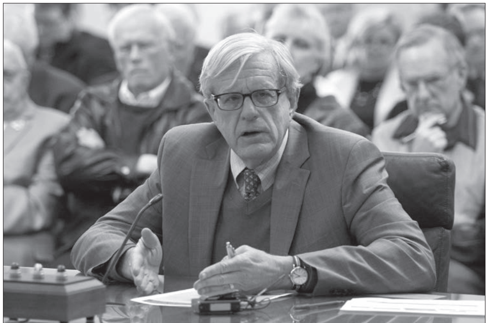
Sen. Brad Ashford said too many inmates are leaving prison without supervision and support.