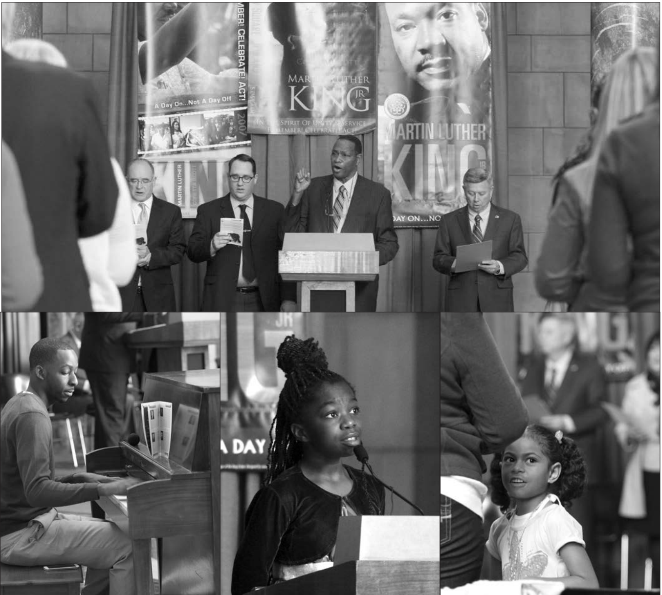
"Remember, Celebrate, Act: A Mission Still to Fulfill" was the theme of this year's Martin Luther King Jr. state celebration in the Rotunda Jan. 17.

PRESRT STD U.S. POSTAGE PAID LINCOLN, NE PERMIT NO. 212