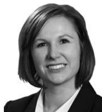
District 29, Lincoln Sen. Kate Bolz

Office: Room 1423, State Capitol Lincoln, NE 68509 (402) 471-2633 bavery@leg.ne.gov