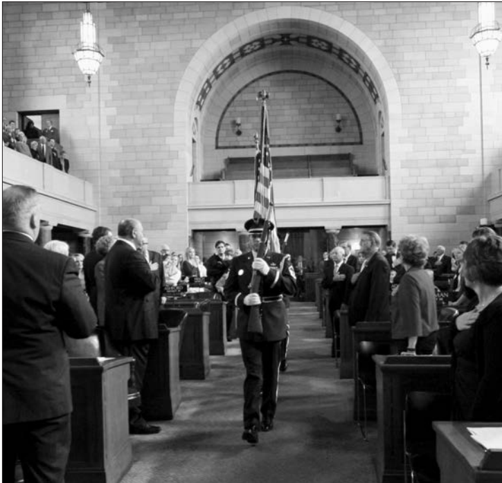
Senators stand at attention as the colors are presented on the first day of session.