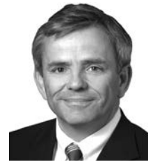
District 12, Omaha Sen. Steve Lathrop

Office: Room 1114, State Capitol Lincoln, NE 68509 (402) 471-2612