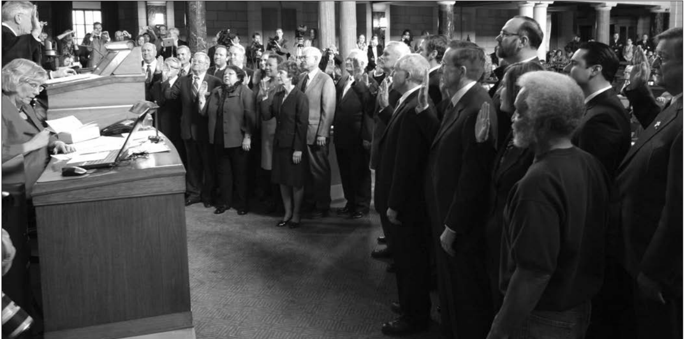
Senators elected in November take the oath of office, administered by Nebraska Supreme Court Chief Justice Michael Heavican (at podium).

The 103 rd Nebraska Legislature convened Jan. 9 for its 90-day first session. Eleven new members were sworn into office and senators were elected to serve as chairpersons of the Legislature's standing committees.