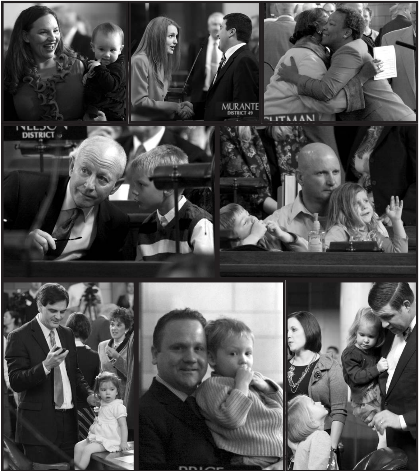
Family and friends gathered in the Norris Chamber to wish senators well on the first day of session Jan. 9.