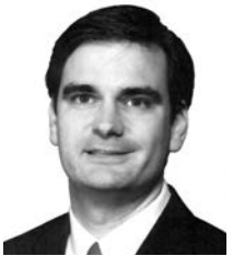
District 4, Omaha Sen. Pete Pirsch

Office: Room 1202, State Capitol Lincoln, NE 68509 (402) 471-2627 sprice@leg.ne.gov