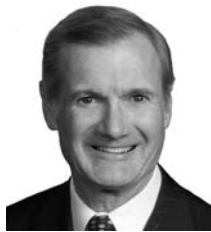
District 35, Grand Island Sen. Mike Gloor

Office: Room 1110, State Capitol Lincoln, NE 68509 (402) 471-2630 adubas@leg.ne.gov