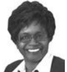
Sen. Brenda Council

Brenda Council, originally would have required all students entering kindergarten to have undergone blood-lead testing.