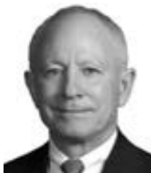
Sen. Greg Adams

ment, adopted 29-0, instead would remove the figure from the notifications altogether.