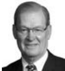
Sen. Tom Carlson

As introduced by Holdrege Sen. Tom Carlson, LB905 would amend the Nebraska Wheat Board's current excise tax levy of 1.25 cents per bushel of wheat to 0.5 percent of the net market value of wheat sold through commercial channels in Nebraska. The board could increase the excise tax by 0.75 percent of net market value.