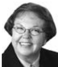
Sen. Kathy Campbell

Senators advanced the bill to select file on a 32-0 vote.