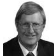
Sen. Paul Schumacher

Omaha Sen. Brenda Council supported the bill, saying it would create jobs statewide.