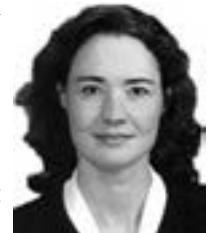
Sen. Abbie Cornett

LB750, introduced by Bellevue Sen. Abbie Cornett, would clarify the types of property that could be used as comparable lands for the purpose of valuing farm home sites. Cornett said the bill was the result of confusion over which properties could be used.