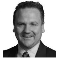
Sen. Colby Coash

Sen. Colby Coash, would create special interest license plates that would be available to car club members who own motor vehicles that are unaltered from original specifications and are collected, preserved, restored or maintained for leisure.