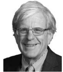
Sen. Brad Ashford

said these academies would provide an alternative educational environment for students who are unsuccessful in the traditional classroom.