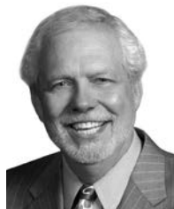
Sen. Rich Pahls

Boys Town Sen. Rich Pahls, sponsor of LB836, said current law allows state and local political subdivisions to invest in certificates of deposit and time deposits through the Certificate of