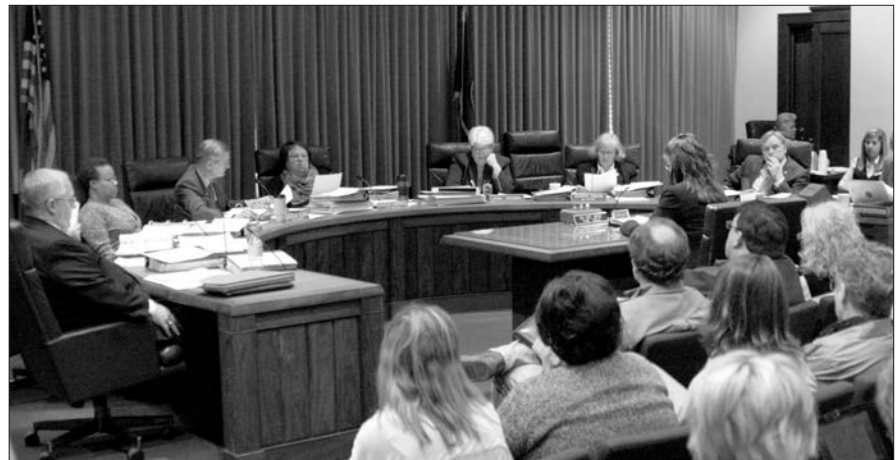
The Legislature's Health and Human Services Committee.