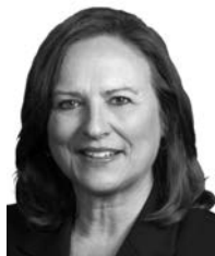
Sen. Deb Fischer

Currently, political calls made by automatic dialing-announcing devices are overseen by two commissions: the Public Service Commission (PSC)—a regulatory agency whose responsibilities include oversight of the telecommunications industry in the state, and the Nebraska Accountability and Disclosure Commission (NADC)—a regulatory agency that administers and enforces the state's campaign finance,