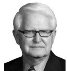
Sen. Bill Avery