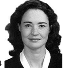
Sen. Abbie Cornett