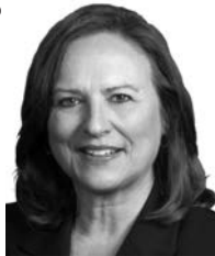
Sen. Deb Fischer