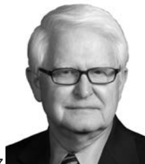
Sen. Bill Avery