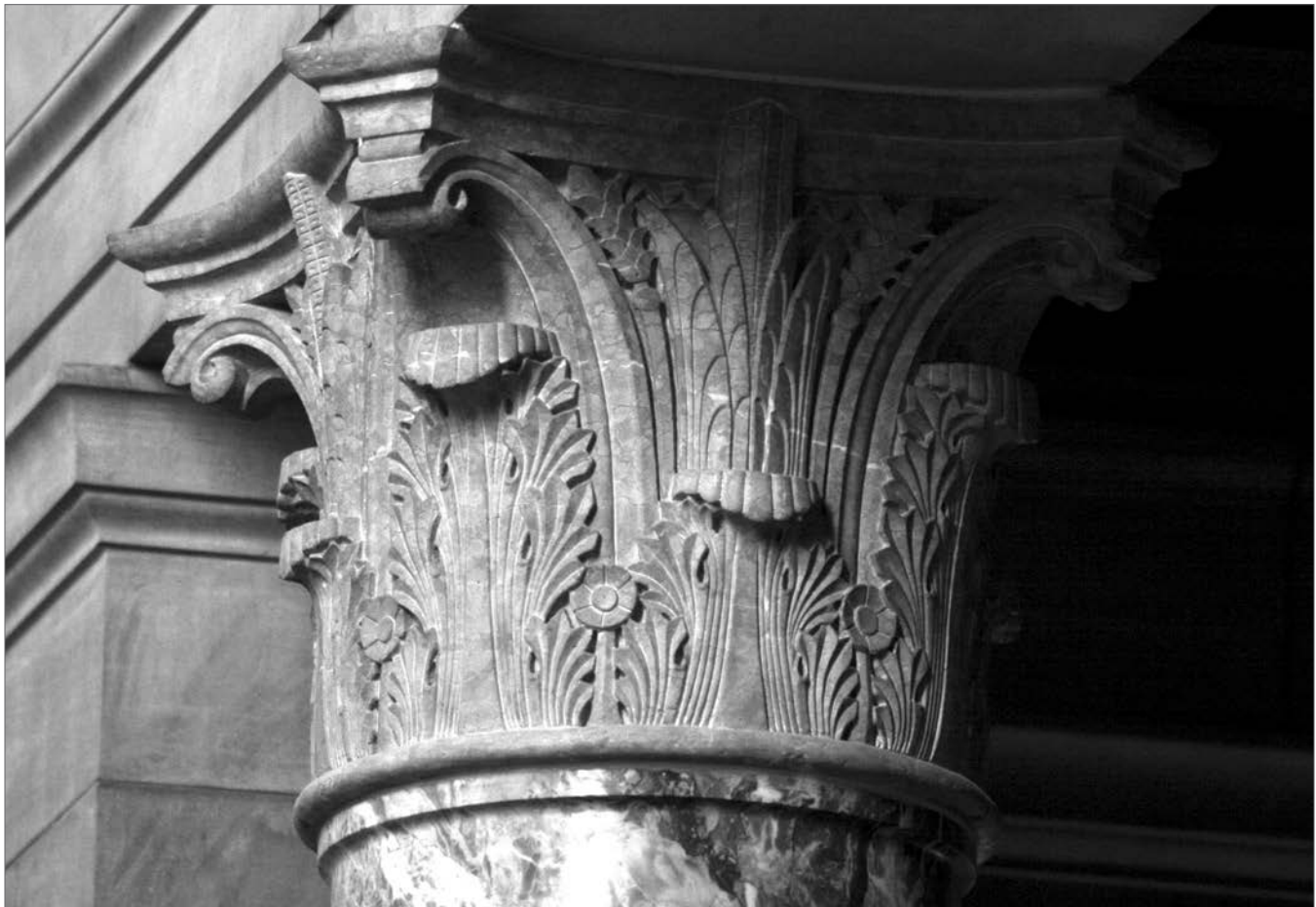
A column in the rotunda of the State Capitol.