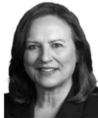
Sen. Deb Fischer

The bill also would allow a repeat drunken driving offender using an ignition interlock permit to drive to an ignition interlock service facility.