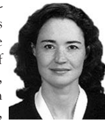
Sen. Abbie Cornett