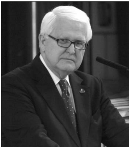
Sen. Bill Avery said the bill is unnecessary because voter fraud is not a problem in Nebraska.

The Legislature adjourned for the day without taking action on LB239. ■