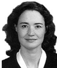
Sen. Abbie Cornett

ous injuries or medical conditions to veterinarians and are prohibited from performing surgeries on animals.