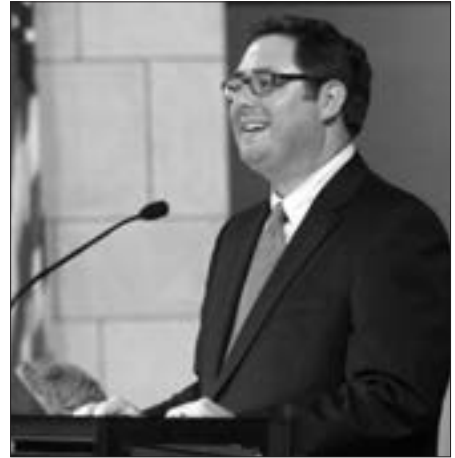
Sen. Mike Flood District 19, Norfolk