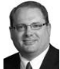
Sen. Russ Karpisek

Sen. Russ Karpisek, increased the minimum contribution rate to 6.5 percent of an officer's salary beginning Oct. 1, 2013. The contribution will increase to 7 percent on Oct. 1, 2015.