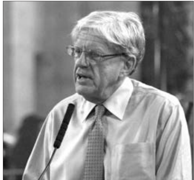
Sen. Brad Ashford urged senators to give cities the authority to make their own funding decisions.