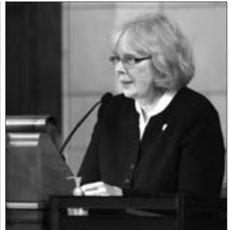
Sen. Gwen Howard District 9, Omaha