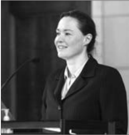
Sen. Abbie Cornett District 45, Bellevue