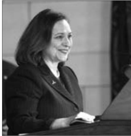
Sen. Deb Fischer District 43, Valentine