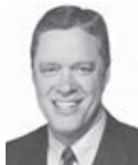
Sen. Dave Pankonin

youth between the ages of 16 and 21 to contribute to projects that conserve or develop natural resources and enhance land and water under the commission's jurisdiction.