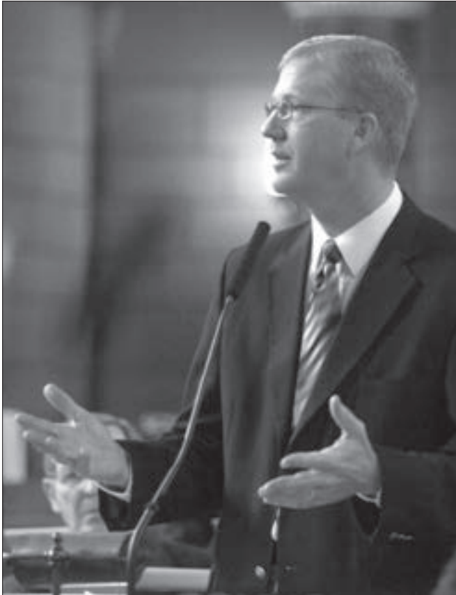
Sen. Chris Langemeier, chairperson of the Natural Resources Committee

W ater funding, oil pipelines and park fees were among the issues tackled by the Natural Resources Committee in 2011.