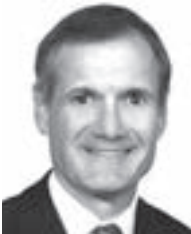
Sen. Mike Gloor

LB274 , sponsored by Grand Island Sen. Mike Gloor, removes the words "dispensing pharmacy" and "immediate" from state law, allowing Nebraska to participate in a nationwide program that provides pharmacies secure containers to collect unused drugs regardless of where they were dispensed. Under the program, containers are shipped to a medical incinerator for disposal when full.