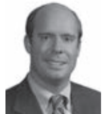
Sen. Burke Harr