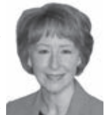
Sen. Kate Sullivan

LB629 requires pipeline companies to restore land disturbed during the construction or operation of an interstate oil pipeline. Restoration costs covered include those incurred to rehabilitate real and personal property, natural resources, wildlife and vegetation.