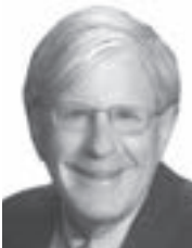
Sen. Brad Ashford

LB357 , introduced by Omaha Sen. Brad Ashford, would permit cities to levy a 2 percent local option sales tax. A description of the proposed use for local option sales tax revenues would be provided on the ballot if a rate increase were proposed.