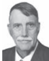
Sen. Norm Wallman

LB415 , introduced by Cortland Sen. Norm Wallman, would make it a Class I misdemeanor to bring prohibited items into a detention facility, provide them to an inmate or for an inmate to possess them. Unlawful items would include weapons, tools or anything that could be useful for an inmate to use to escape.