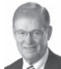
Sen. Tom Carlson

LB400 , passed on a 47-1 vote, contains provisions of LB528 , introduced by Holdrege Sen. Tom Carlson. The bill extends to FY2017-18 the expiration of a property tax offered to NRDs in overappropriated or fully appropriated basins. The 3-cent per $100 of taxable value property tax is used for costs of administering and implementing ground water management activities and integrated management activities under the Nebraska Ground Water Management and Protection Act that exceed the amount budgeted for such activities in FY2005-06.