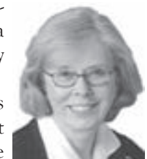
Sen. Gwen Howard

LB94 , introduced by Omaha Sen. Gwen Howard, requires that adoptive parents have access to a child's HHS file after filing a petition for adoption and before entry of an adoption decree.