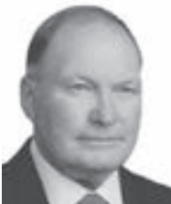
Sen. LeRoy Loudon

LB486 , introduced by Ellsworth Sen. LeRoy Loudon, increases from 7 to 9 percent the salary cap in the School Employees Retirement Plan beginning July 1, 2012, and eliminates current salary cap exemptions for purposes of calculating benefits on annual compensation during the last five years of employment prior