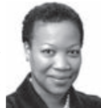
Sen. Tanya Cook

The penalty for hanging objects in rearview mirrors was reduced with LB500 , introduced by Omaha Sen. Tanya Cook and approved 46-0. The bill changed the penalty for placing objects in a vehicle that interfere with the driver’s view from a Class V misdemeanor to a traffic infraction. The bill also limits the violation to objects that “significantly and materially” obstruct or interfere with the view of a driver.