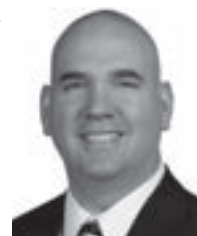
Sen. Scott Price