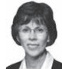
Sen. Annette Dubas