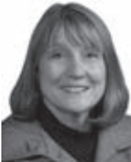
Sen. Lydia Brasch

Under LB368 , sponsored by Bancroft Sen. Lydia Brasch, political parties are prohibited from nominating a candidate for an office at a state post-primary convention if the party did not nominate a candidate for the office at the primary election.