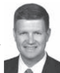
Sen. Beau McCoy

LB19 expands the Uniform Controlled Substances Act to ban the class of synthetic cannabinoids used to make the drug commonly known as K2 or Spice.