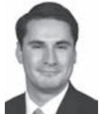
Sen. Heath Mello

LB682 would offer state assistance to finance the construction, acquisition or improvement of sewer infrastructure to address combined sewer overflows. Assistance would be calculated based on the amount of state sales tax collected from increased fees and charges to complete such projects.