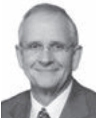
Sen. John Harms

Permits authorizing overweight and oversized loads and tows are expanded by LB35 , introduced by Scottsbluff Sen. John Harms and passed 46-0. The bill increases to 210 days the maximum life of a department overweight or overlength permit for hauling loads of grain, sugar beets and other seasonally harvested products.