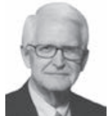
Sen. Bill Avery

Finally, the committee indefinitely postponed a bill that would have prohibited restaurants from offering toys with meals that fail to meet certain nutritional standards. LB126 , introduced by Lincoln Sen. Bill Avery, would have prohibited restaurants and convenience stores from advertising, marketing, supplying or selling consumer incentive items associated with the purchase of a packaged child's meal if the meal failed to meet nutritional standards. ■