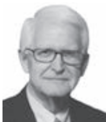
Sen. Bill Avery