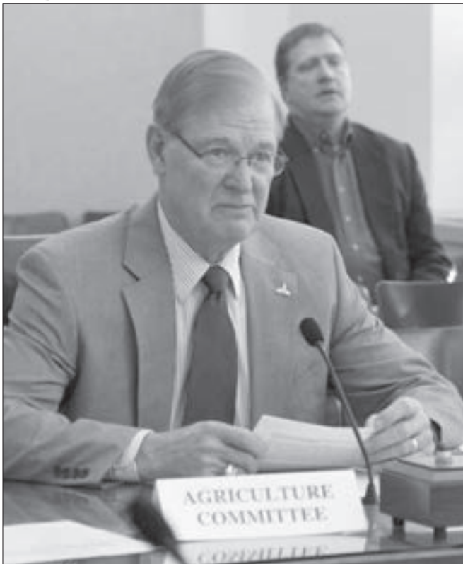
Sen. Tom Carlson, Agriculture Committee chairperson

The Agriculture Committee addressed a number of issues during the 2011 session, including fencing law, a brand inspection surcharge, the feasibility of a state meat inspection program and a statewide standard for honey.