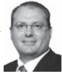
Sen. Russ Karpisek

LB161 , introduced by Wilber Sen. Russ Karpisek, would have permitted a candidate to request a manual recount at his or her expense. Current law triggers automatic machine recounts paid by political subdivisions if the margin of victory is 1 percent or less for an election in which more than 500 votes were cast, or 2 percent or less for elections in which 500 or fewer votes were cast.