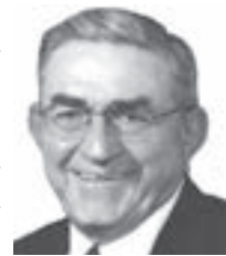
Sen. Dennis Utter

LB385 , introduced by Hastings Sen. Dennis Utter at the request of the governor, suspends the Low-Income Home Energy Conservation Act until July 1, 2014, at which point the Legislature will appropriate $250,000 to the program each biennium. Participating utilities may dedicate up to $50,000 per fiscal year to be matched. The bill was passed 46-0 and will terminate the act on July 1, 2019.