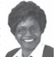
Sen. Brenda Council