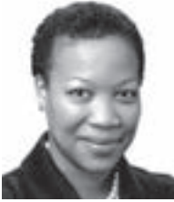
Sen. Tanya Cook

The department may work with non-profit organizations to seek gifts, grants and donations to assist in implementing the plan and will be exempt from administering it if sufficient federal or private funds are not secured.