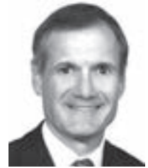
Sen. Mike Gloor

LB590 , introduced by Grand Island Sen. Mike Gloor and passed 48-0, changes laws regulating tobacco licenses, tobacco sales, cigarette taxes, the state directory of cigarettes, escrow deposits under the Master Settlement Agreement and reporting requirements.