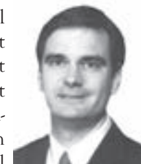
Sen. Pete Pirsch