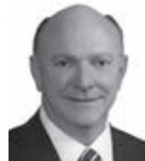
Sen. Jim Smith

LB589 , introduced by Papillion Sen. Jim Smith and passed 45-0, allows a county, city or village temporary use of the state highway system, other than a freeway, that is located within its jurisdiction for special events. Under the bill, the county, city or village will be liable if damages or injuries occur during the event.