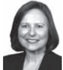
Sen. Deb Fischer

LB84 , introduced by Valentine Sen. Deb Fischer and passed 33-10, directs 0.25 cents of the state's 5.5-cent sales tax to roads projects from fiscal year 2013-14 through FY2032-33. Eighty-five percent of these funds will be deposited in a new State Highway Capital Improvement Fund. The remaining 15 percent of the new revenue will go to the Highway Allocation Fund.