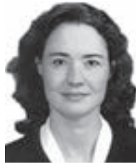
Sen. Abbie Cornett

The committee also advanced a bill that would create an outstanding dog breeder designation. LB427 , introduced by Bellevue Sen. Abbie Cornett, would permit the department to designate outstanding commercial dog breeders that meet certain criteria and list them on the department's website. The bill also would require commercial breeders to provide responsible medical care for their dogs and set minimum standards for their dogs' primary enclosures. The bill remains on general file.