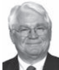
Sen. Galen Hadley

DED also is required to establish an innovation in value-added agriculture program to support small enterprise formation in Nebraska's agricultural sector.