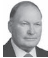
Sen. LeRoy Louden

Counties could adopt black-tailed prairie dog management programs under a bill advanced by the committee. LB473 , introduced by Ellsworth Sen. LeRoy Louden, would permit counties to adopt resolutions creating coordinated black-tailed prairie dog management programs. Landowners would be required to prevent colonies on their property from expanding to a neighboring property if the adjacent landowner objects to the expansion.