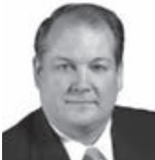
Sen. Scott Lautenbaugh

Introduced by Omaha Sen. Scott Lautenbaugh, LB142 increases the cap on nonindividual contributions that candidates choosing to abide by voluntary campaign spending limitations may accept.