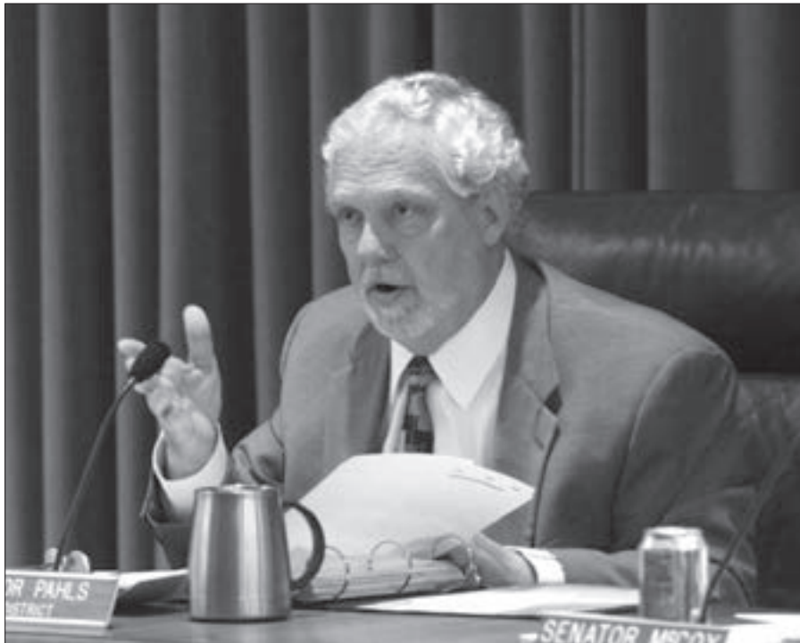
Sen. Rich Pahls, chairperson of the Banking, Commerce and Insurance Committee

Insurance and commerce priorities addressed by lawmakers this session included insurance coverage for abortions, economic development proposals and regulation.