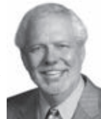
Sen. Rich Pahls

The bill also requires multiple-member school districts collaborating on a focus or magnet school or program to form a joint entity to assign legal, fi-