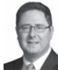
Sen. Mike Flood