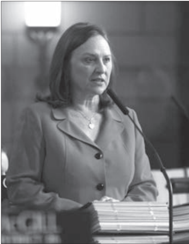
Sen. Deb Fischer, chairperson of the Transportation and Telecommunications Committee

The most prominent transportation-related bill passed this session commits 0.25 cents of the state’s 5.5-cent sales tax to roads projects, beginning in fiscal year 2013-14. Introduced by committee chairperson Sen. Deb Fischer of Valentine, LB84 was considered by the Revenue Committee and passed 33-10.