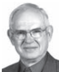
Sen. Ken Haar

Senators also passed legislation to create a conservation program for at-risk youth. LB549 , introduced by Omaha Sen. Brenda Council and approved 44-0, creates the Nebraska Youth Conservation Program to be administered by Game and Parks. The program will employ at-risk