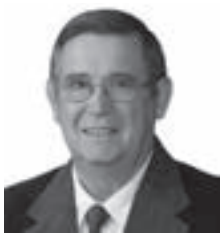
Sen. Dave Bloomfield

Under a bill held in committee, a political subdivision could restrict sexual predators from living within 500 feet of a park that covers at least 2,500 square feet. LB508 , introduced by Hoskins Sen. Dave Bloomfield, would not be retroactive.