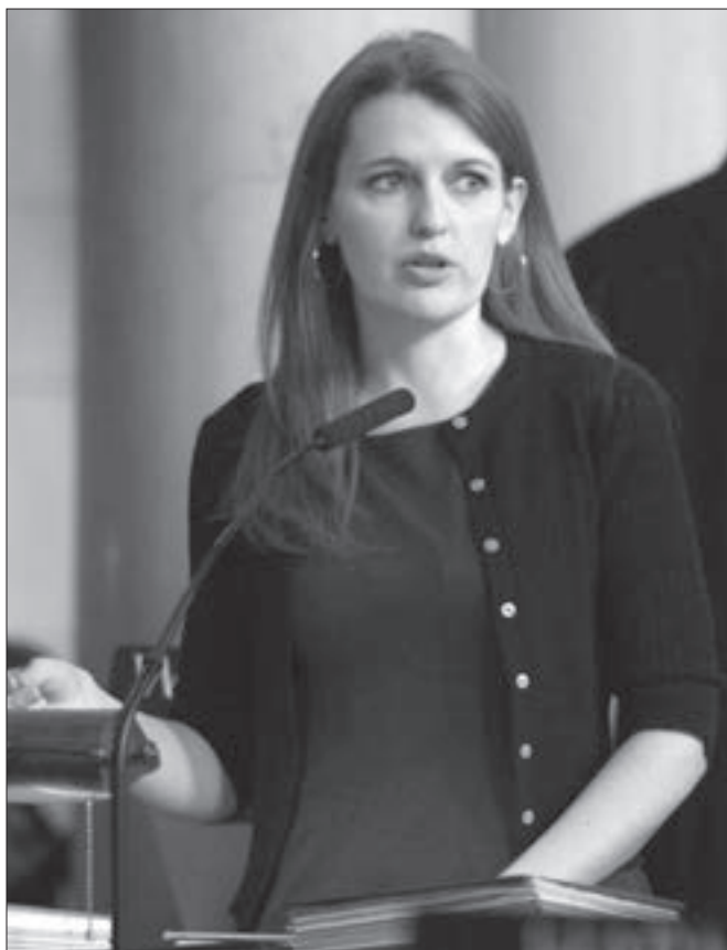
Sen. Amanda McGill, chairperson of the Urban Affairs Committee

Measures relating to revenue bonds and building codes topped the list of issues heard by the Urban Affairs Committee and addressed by the Legislature this session.