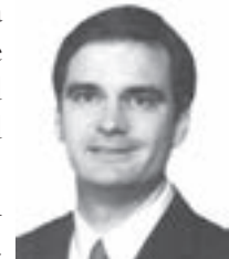
Sen. Pete Pirsch