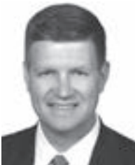
Sen. Beau McCoy

Additionally, the bill prohibits private health insurance policies in the state from providing coverage for an abortion, except through an optional rider paid for solely by the insured. A health insurance plan issuer is