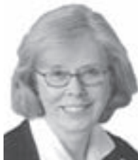
Sen. Gwen Howard

Introduced by Omaha Sen. Gwen Howard, LB95 would require any lead agency contracting with HHS to be accredited by a national accrediting entity, within 18 months of entering into a contract with HHS or of the bill's passage, with respect to out-of-home services provided to those under the age of 19.