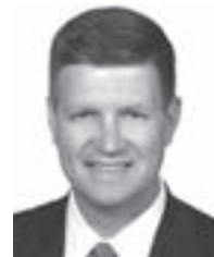
Sen. Beau McCoy

LB303 , sponsored by Omaha Sen. Beau McCoy, repeals requirements that the Nebraska Investment Council: