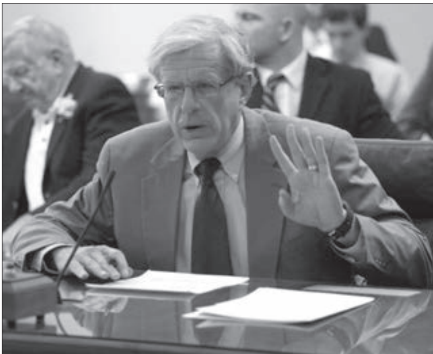
Sen. Brad Ashford, chairperson of the Judiciary Committee

Senators approved a bill this session that prohibits chemical abortions from being administered from remote satellite locations. Measures relating to driving under the influence (DUI), juvenile truancy, a substance ban and picketing funerals also were passed.