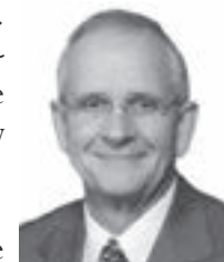
Sen. John Harms

Senators also passed a bill to promote the state's Supplemental Nutrition As-