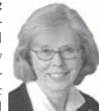
Sen. Gwen Howard