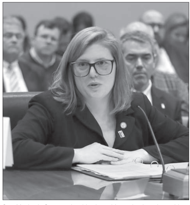
Sen. Machaela Cavanaugh said universal free school meals would help the one in six Nebraska children who are food insecure.

bursement program, called the community eligibility provi- CEP would be reimbursed 30 cents for each reducedsion, that allows schools with high poverty rates to serve free