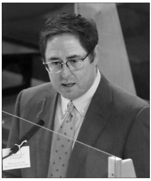
Sen. Michael Flood successfully increased funding for creative districts.

munities and change the trajectory of economic development in rural areas.