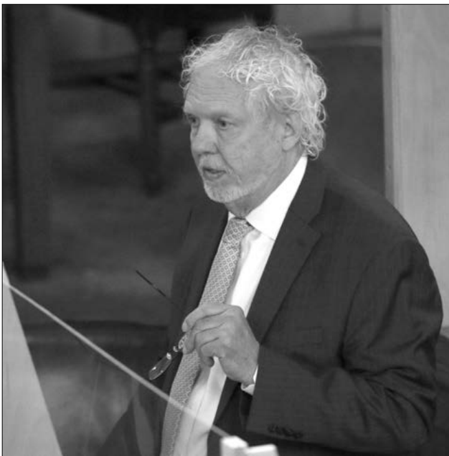
Sen. Rich Pahls said LB281 should require both public and private schools to adopt child sexual abuse prevention programs.

Senators then voted 32-1 to advance the bill to select file. ■