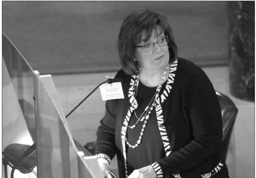
Sen. Joni Albrecht said similar legislation in 37 other states has helped stop or prevent child sexual abuse.

Elkhorn Sen. Lou Ann Linehan supported the committee amendment and LB281. She said the Legislature shelved a similar proposal several years ago after the state Department of Education indicated that it would