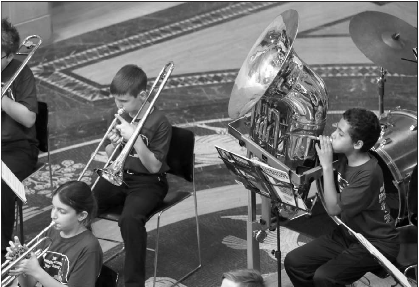
Students in the Hartington-Newcastle 5th/6th grade band performed in the Rotunda March 22, as part of a week-long concert series to observe Music In Our Schools Month.

PRESRT STD U.S. POSTAGE PAID LINCOLN, NE PERMIT NO. 212