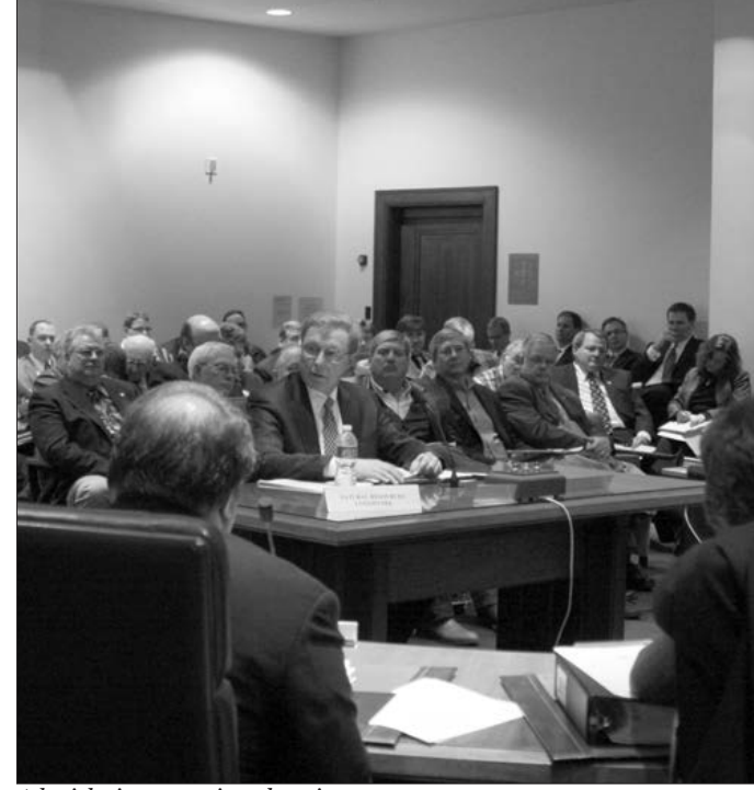
A legislative committee hearing

A senator brings his or her idea for a new law to a bill drafter, who works with the senator to transform the idea into the proper legal form for a bill. Unlike some