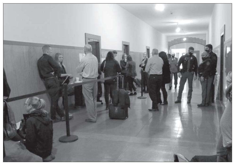
Testifiers line a Capitol hallway Feb. 4, waiting to speak on vaccine proposals.

The committee took no immediate action on LB447. ■