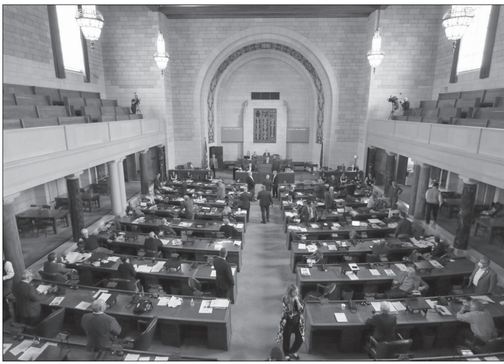
Only lawmakers, essential staff and the media were allowed in the legislative chamber while senators worked to pass LB1198.

Funds will be transferred from the state's Cash Reserve Fund to the Governor's Emergency Cash Fund. Dollars then will be directed to a newly created program to be known as the Governor's Emergency Program –