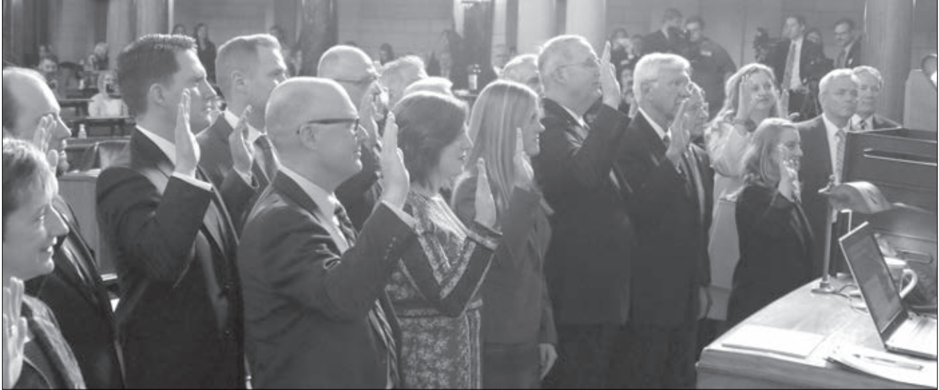
New and re-elected senators took the oath of office on Jan. 9, the opening day of the 2019 legislative session.

The 106th Nebraska Legislature convened Jan. 9 for its 90-day first session. Thirteen new members and 13 re-elected senators were sworn into office, and lawmakers elected chairpersons of the Legislature's standing committees.