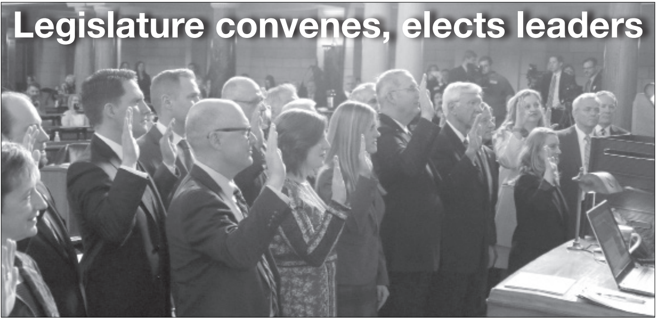
New and re-elected senators took the oath of office on Jan. 9, the opening day of the 2019 legislative session.

The 106th Nebraska Legislature convened Jan. 9 for its 90-day first session. Thirteen new members and 13 re-elected senators were sworn into office, and lawmakers elected chairpersons of the Legislature's standing committees.