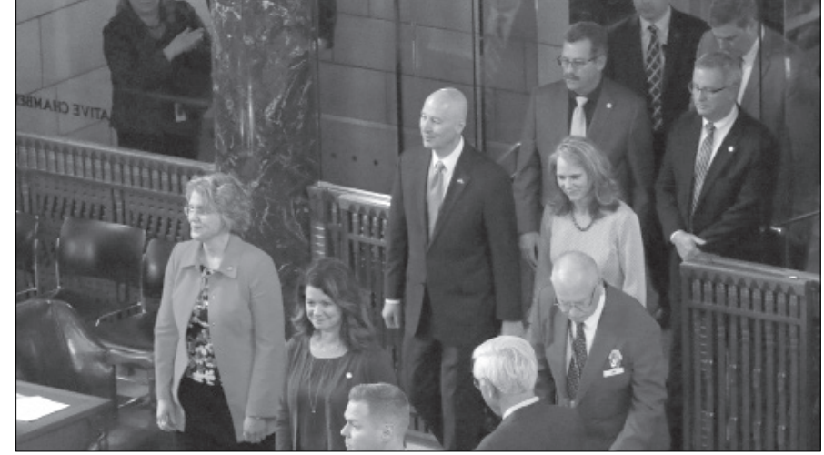
Senators escort Gov. Pete Ricketts and first lady Susanne Schorr into the legislative chamber for the State of the State address.

includes a record $1.1 billion in K-12 education spending.