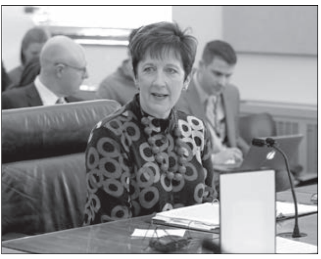
Sen. Patty Pansing Brooks said employers continue to pay women considerably less than men for doing the same work.

representing the Nebraska Chamber of Commerce. He said the protections proposed under LB1014 already have been addressed through federal legislation.