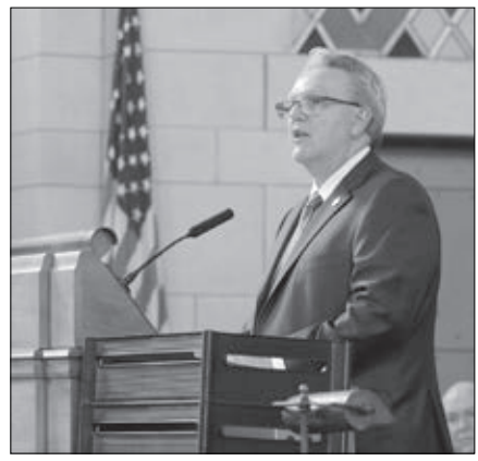
Speaker Jim Scheer

Norfolk Sen. Jim Scheer, speaker of the Legislature, said Nebraskans' desire for public access to elected officials and transparency in the legislative process is manifested in the state's unicameral Legislature. George Norris, a U.S. Senator and congressman from Nebraska who was instrumental in converting the state's legislature to a one-house system in the 1930s, believed that a unicameral system emphasized that all citizens are