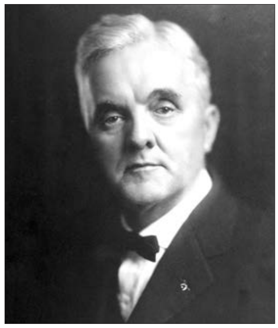
George W. Norris

The change did not come easily. Nebraskans rejected similar proposals several times before interest in reining in state spending heightened because of the Great Depression. The cause also was helped by a zealous petition campaign led by the prestigious U.S. Sen. George